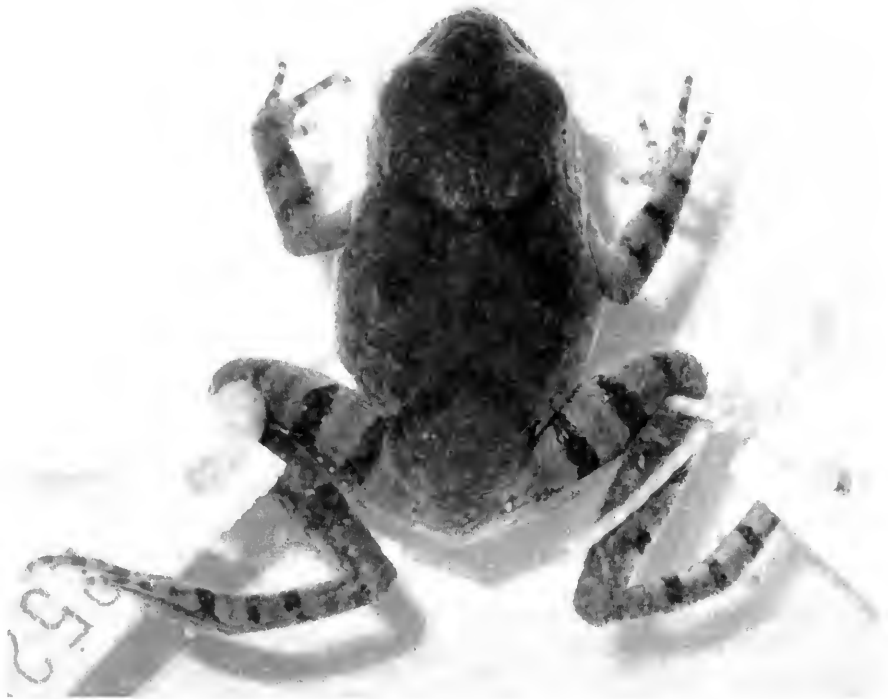
FIG. 2. Leptotalax tuberosus , new species. Holotype, male, 26.1 mm.

a small, oval inner metatarsal tubercle, no outer one.