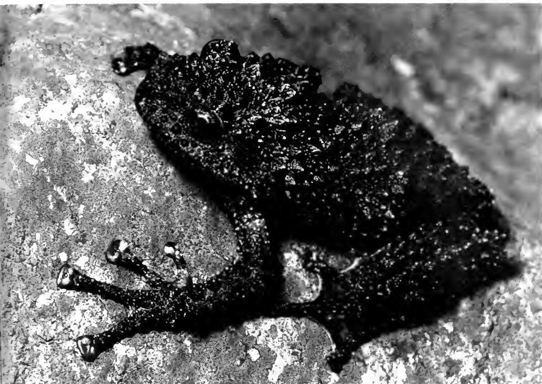
FIG. 17. Theloderma corticalis (Boulenger). Female, 70.0 mm.

ram Lap, and one female from Tam Dao. These are clearly conspecific with the holotype of T. gordoni (FMNH 172248). The skin is extremely rough, with many pustulose ridges and tubercles on top of the head, temporal region, back, and dorsal and lateral surfaces of the limbs. There is a very dense cluster of large spinose tubercles on the parts behind the tympanum, and the chin and throat have small pustulose tubercles, in sharp contrast with the smoothly granular chest and belly. The vomerine teeth are in small, widely separated, oblique groups near the anterior corners of the choanae. The distinct tympanum is slightly more than half the diameter of the eye. The Tam Dao female differs from the other two in having the rows of the dorsal warts coalesced into ridges.