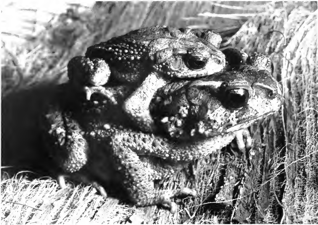
FIG. 3. Bufo galeatus Günther. Pair in amplexus. Male, 50.5 mm; female, 85.3 mm.