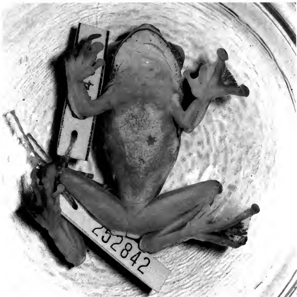
FIG. 15. Rhacophorus exechopygus , new species. Paratype, male, 46.4 mm.

work in upper half, darker in lower half. In preservative uniform purplish gray on all dorsal surfaces and upper half of side; lower part of side with black band from axilla to groin, or black at axilla and groin only, or with a row of large black spots; one specimen with light spots (blue in life?) within black area at groin; throat and abdomen white; rear face of thigh black; front face of thigh white or black; ventral surface of calf black or white; dorsal surface of outer fingers and toes with coloration of back, inner digits without dark pigment; web dark on dorsal surface, colorless or pale reddish ventrally.