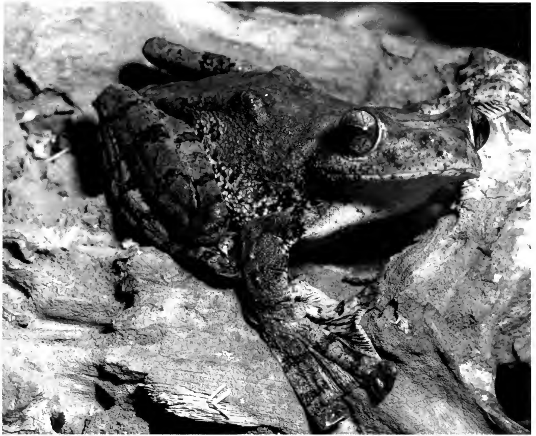
FIG. 10. Rhacophorus annamensis Smith. Female, 84.5 mm.

embles the male of the type series in this character.