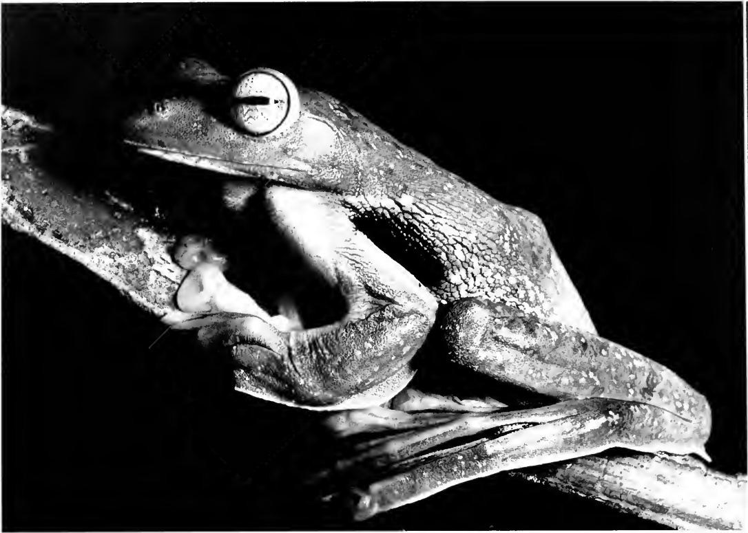
FIG. 16. Rhacophorus reinwardtii (Schlegel). Female, 85.2 mm.

pygus differs from other syntopic species of Rhacophorus in dermal appendages ( R. verrucosus Boulenger, R. bipunctatus Ahl, R. annamensis Smith, R. calcaneus Smith, and R. baliogaster , new species, without a wide infra-anal projection) and coloration ( R. baliogaster with boldly spotted abdomen, R. bipunctatus with black spots on the side, R. calcaneus with dark dorsal markings, and R. annamensis with black dotted throat). Other Rhacophorus from Southeast Asia differ from R. exechopygus in (1) the type of dermal appendages ( R. appendiculatus [Günther] with strong crenulated fringe or row of conical tubercles along forearm and tarsus; R. taronensis Smith and R. turpes Smith without infra-anal projection), and (2) coloration (none of the listed species has an immaculate dorsal pattern).