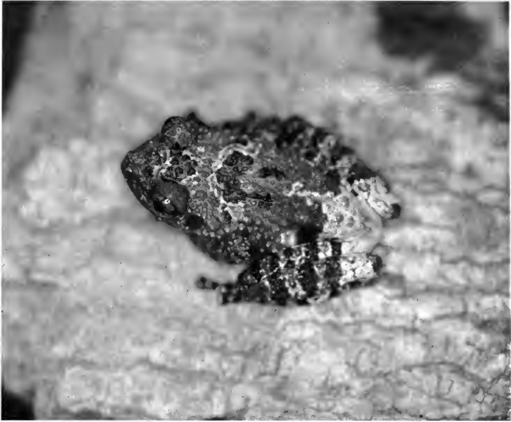
FIG. 18. Theلودerma stellatum Taylor. Female, 32.3 mm.

One specimen was found on the trunk of a fallen tree in a small forest clearing. Another was perched on the broad leaf of a shrub about 5 m from a forest stream.