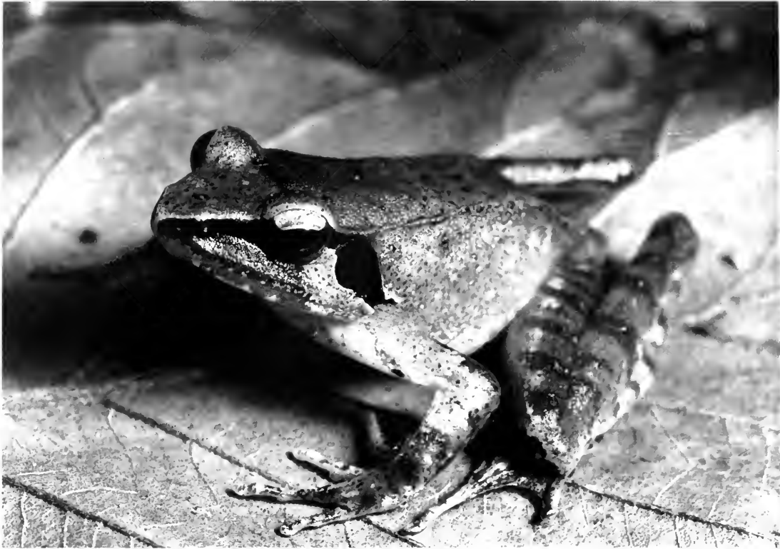
FIG. 7. Rana johnsi Smith. Female, 46.7 mm.

on the second finger. The first and fifth toes have movable flaps of skin externally. The first three toes and the fifth are fully webbed to the base of the swollen tips. There are two wide, black bars from the eye to the lip. The upper half of the tympanum and the supratympanic fold are covered by a black streak. In about one-fourth of the individuals, there is a light vertebral stripe.