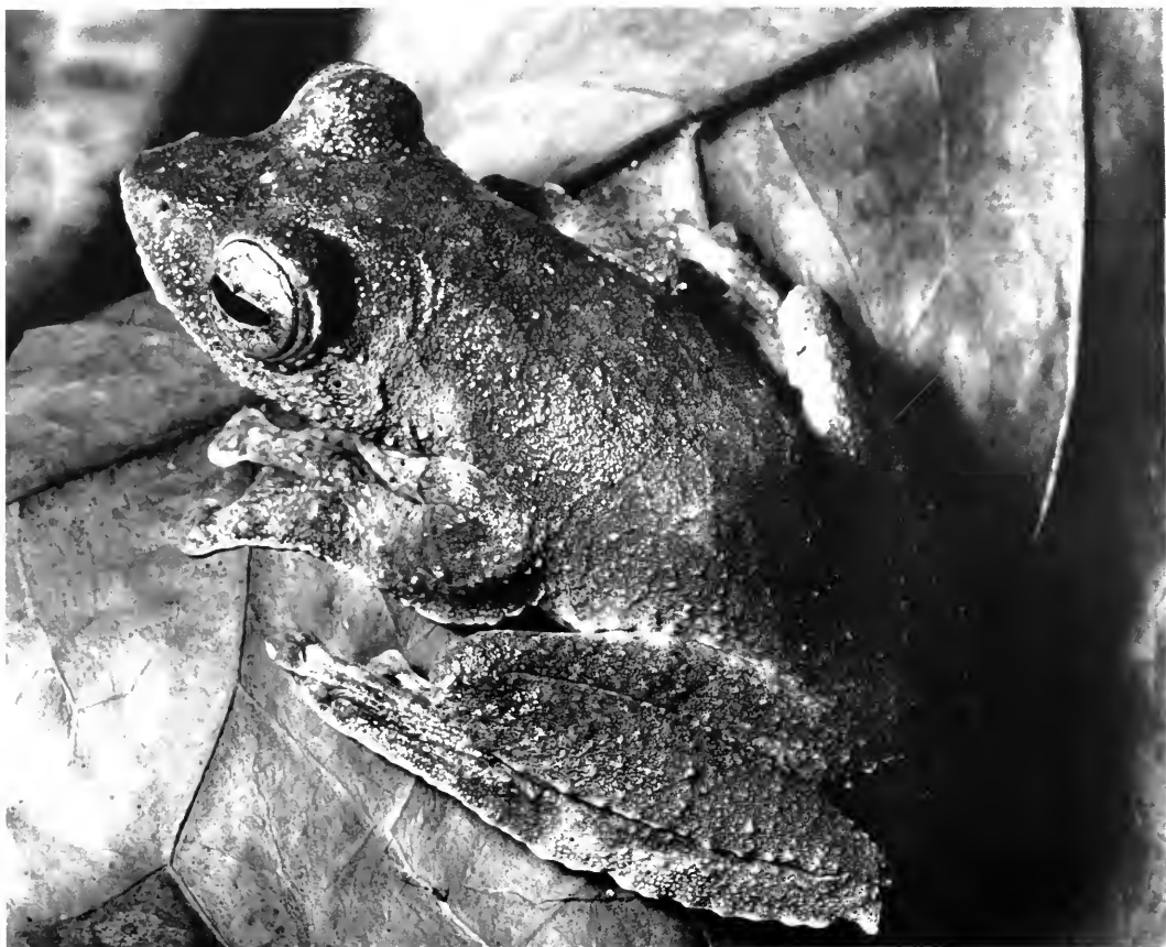
FIG. 14. Rhacophorus exechopygus , new species. Holotype, male, 46.5 mm.

Vietnam, 21 April 1995 by Ilya Darevsky and Nikolai Orlov.