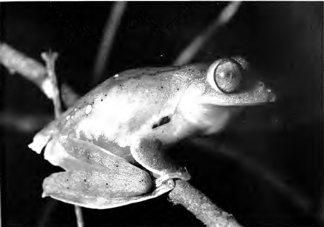
FIG. 12. Rhacophorus bipunctatus Ahl. Male, 37.3 mm.