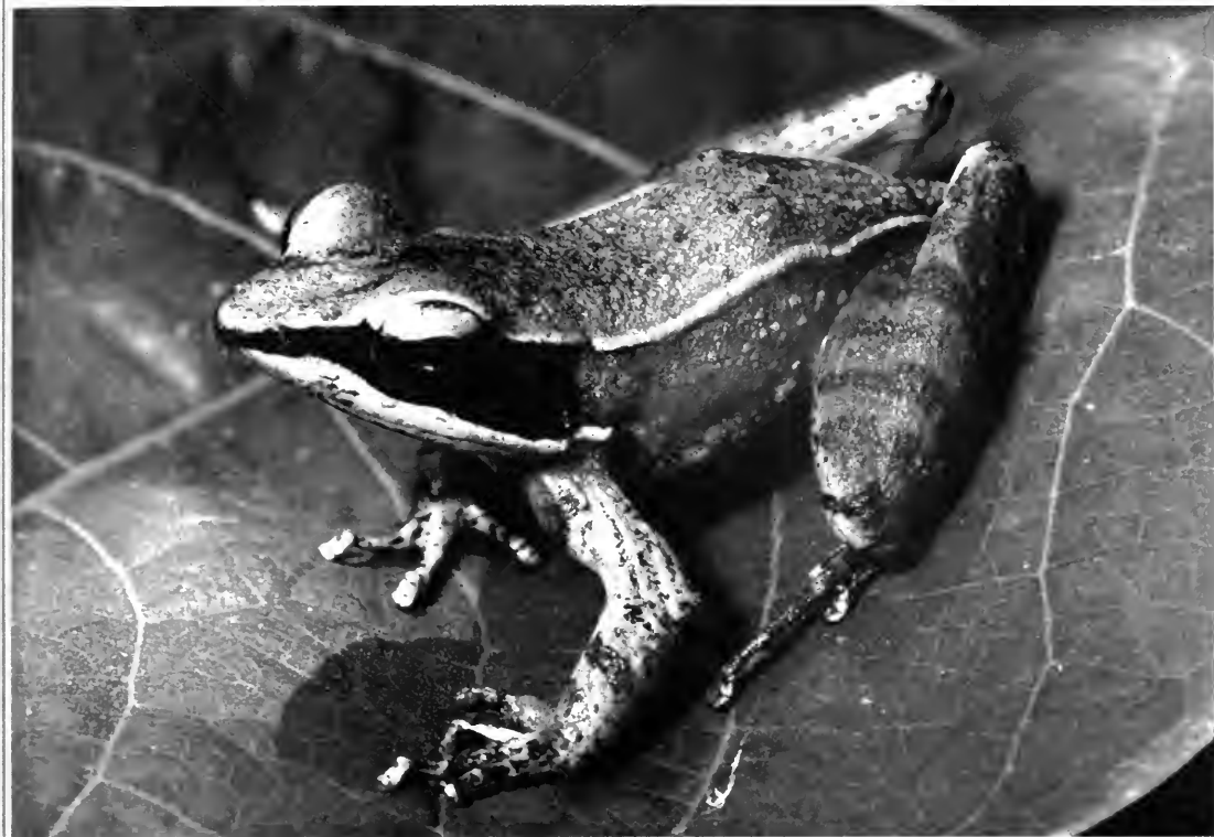
FIG. 5. Rana attigua , new species. Male, 44.9 mm.

of hind limb with tubercles; ventral surfaces smooth.