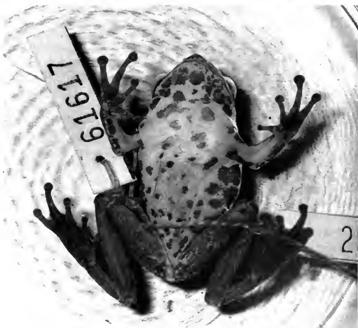
FIG. 11. Rhacophorus baliogaster , new species. Holotype, male, 33.0 mm.