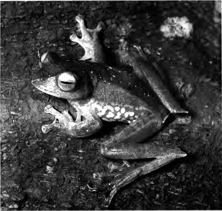
FIG. 13. Rhacophorus calcaneus Smith. Male, 35.4 mm.

network enclosing large white spots; iris light tan or yellowish brown in upper half, darker grayish brown below; front and rear of thigh reddish brown. In preservative ground color dorsally gray or pinkish; no large black spots laterally in present sample; lateral black network faint in some individuals; supra-anal ridge pinkish white; ventrally white usually with fine dark dots or immaculate white; limbs with dark crossbars; ventral surfaces of thigh and calf with small black dots; front and rear of thigh pale pinkish or flesh-colored, immaculate (10) or dotted with black (4), or rear of thigh dark brown (11).