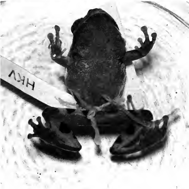
FIG. 9. Philautus abditus , new species. Paratype, male, 28.1 mm.