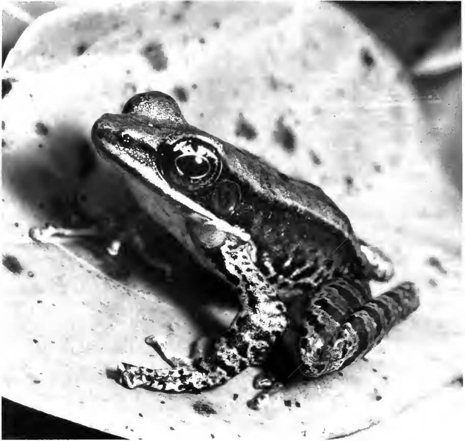
FIG. 8. Rana nigrovittata (Blyth). Male, 52.9 mm.

15), of females 0.37–0.41 (median 0.390, N = 16 ); tympanum/SVL of males 0.081–0.109 (median 0.093, N = 15 ), of females 0.074–0.091 (median 0.083, N = 16 ). Differences between the sexes in these three body proportions are significant at the P < 0.01 level (Mann-Whitney U -test).