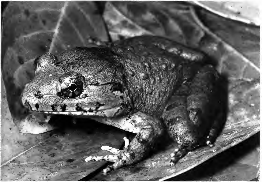
FIG. 6. Rana cf. blythii . Male, 73.8 mm.

evations from 700 to 1200 m ASL. Males have enlarged odontoids at the front of the mandible and distinctly enlarged heads, but they lack nuptial pads and vocal sacs. The tympanum is superficial. Although these frogs are clearly part of the R. blythii species group, they differ significantly in a number of ways from typical R. blythii of the Malay Peninsula and Thailand. In the Vietnam