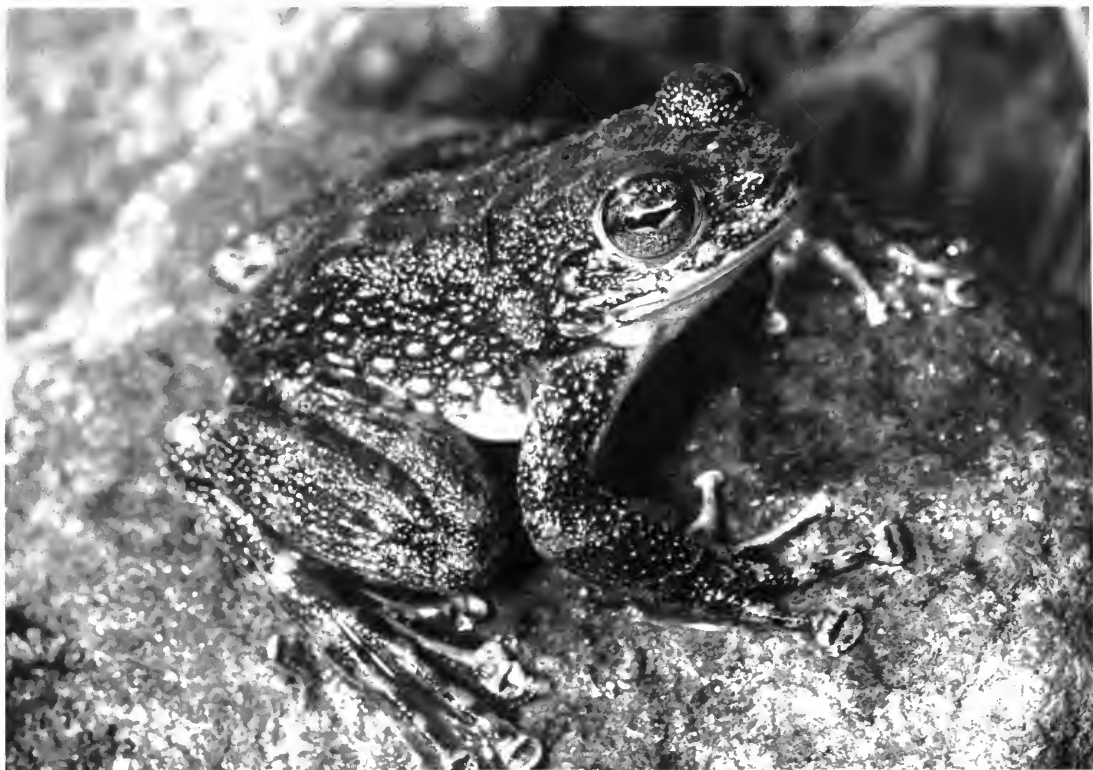
FIG. 4. Amolops spinapectoralis , new species.