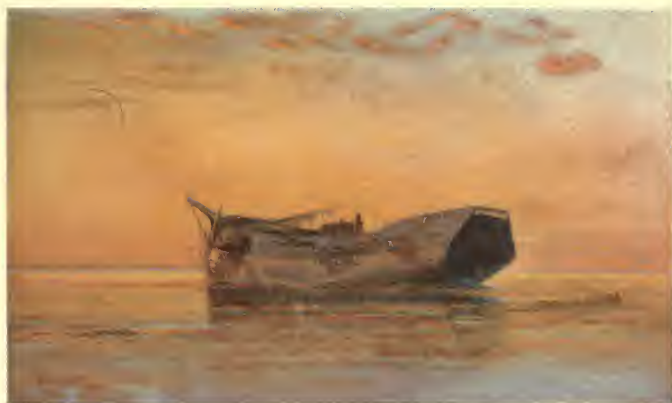
MY FIRST SHIP PAINTED IN 1854