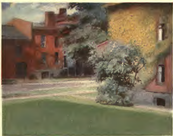
A SKETCH FROM MY HOME PORCH PAINTED IN 1903