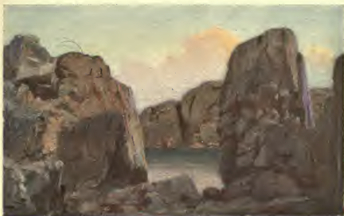
MARBLEHEAD ROCKS PAINTED IN 1874