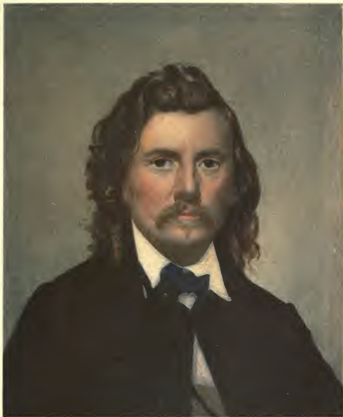
WILLIAM H. BEARD, N. A. PAINTED IN 1852