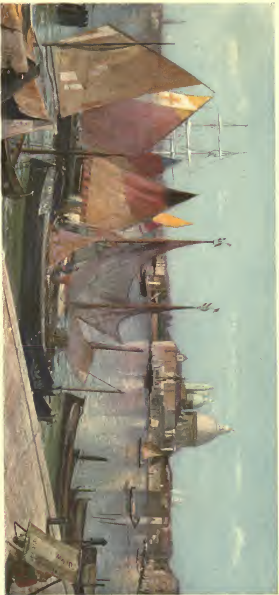
FROM MY WINDOW IN VENICE PAINTED IN 1875