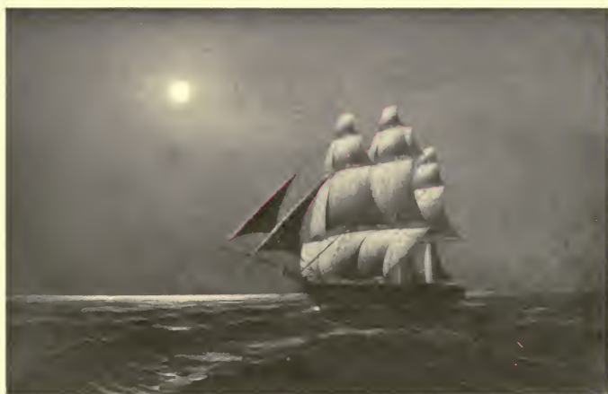
FRIGATE BY MOONLIGHT PAINTED IN 1873