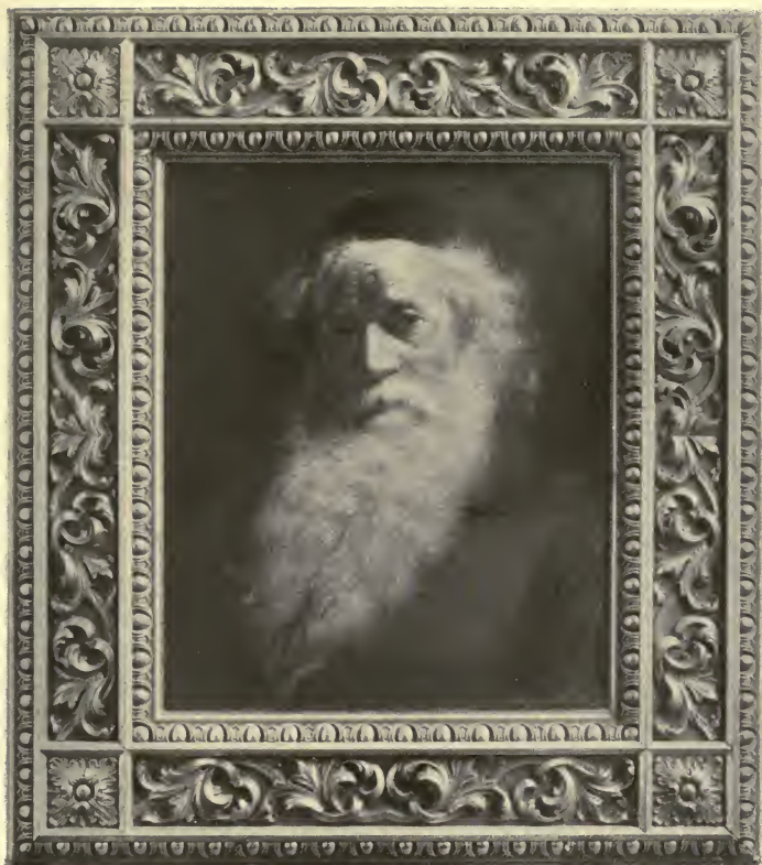
THE RABBI PAINTED IN 1867