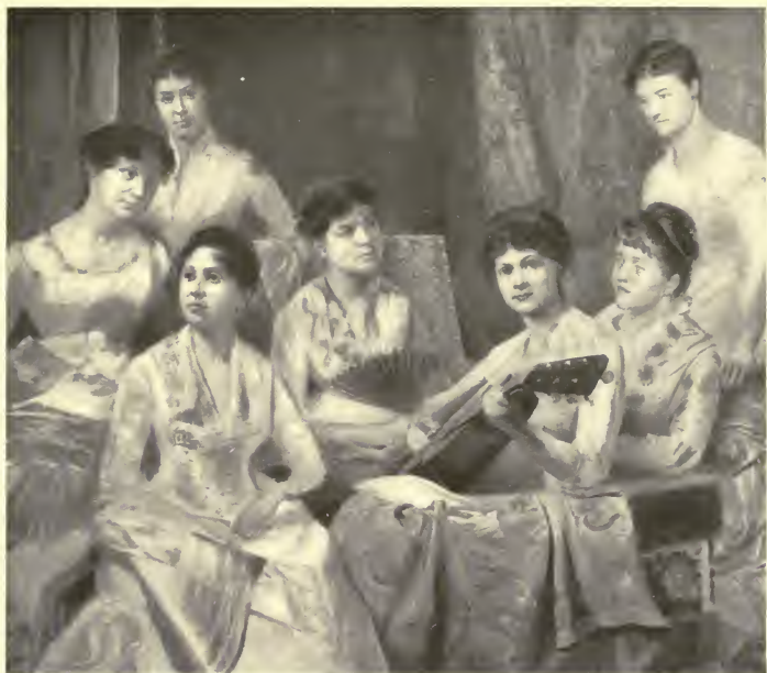
THE SEVEN (unfinished group) PAINTED IN 1885