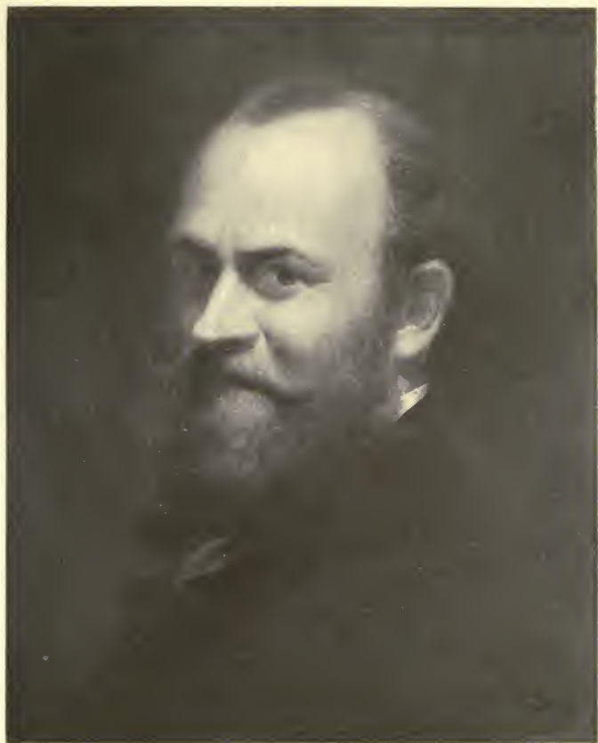
MY PORTRAIT, AT 40 PAINTED IN 1859