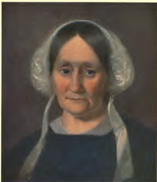
MY MOTHER PAINTED IN 1854