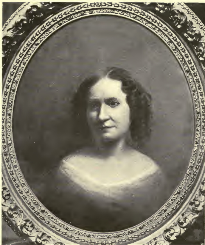
MY WIFE PAINTED IN 1856