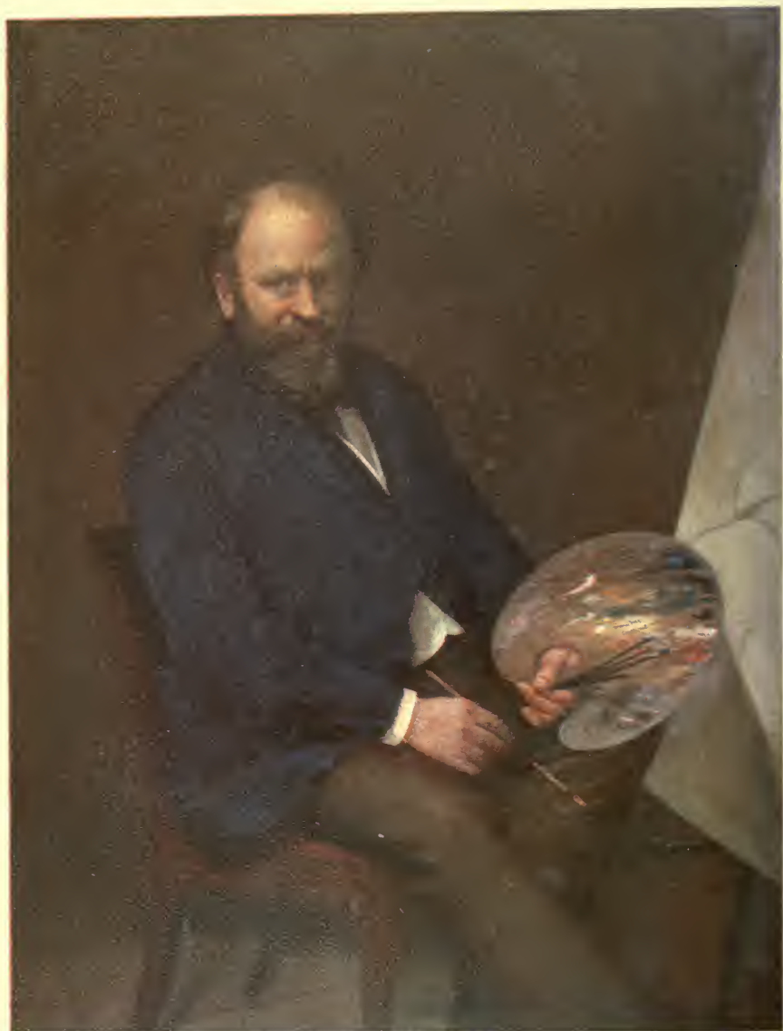
LARS GUSTAF SELLSTEDT NATIONAL ACADEMY, 1872