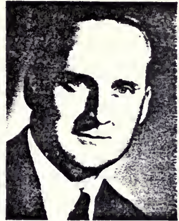
SENATOR THOMAS M. REES

Also approved was Senator Rees' vocational high schools bill, S.B. 1379, which sets up a county-wide program for young people who have the aptitude and desire to train themselves for vocational trades rather than to follow a strictly college preparatory course. This bill is in line with the current national effort towards automation retraining and job opportunities.