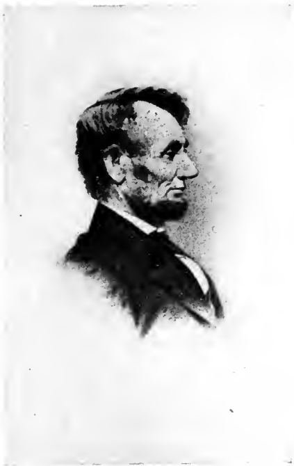
Lincoln during his presidency, from a photograph by Brady. Shown here by courtesy of the Century Company.