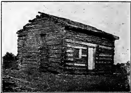
The cabin in which Lincoln was born as it looks today.

“I want it said of me that I plucked a thistle and planted a flower where I thought a flower would grow.”— A. Lincoln.