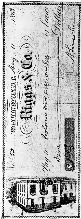
Fac simile of a Lincoln check.