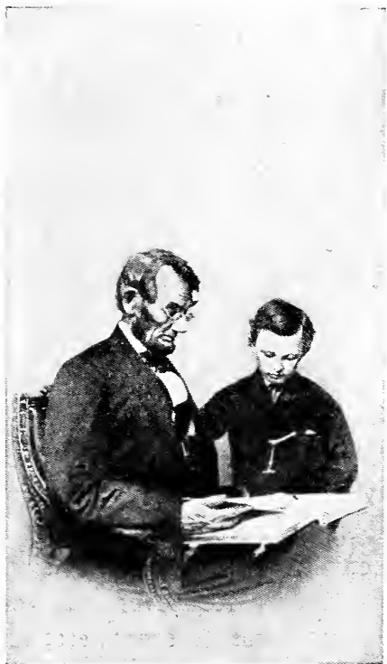
Lincoln and his son Tad.