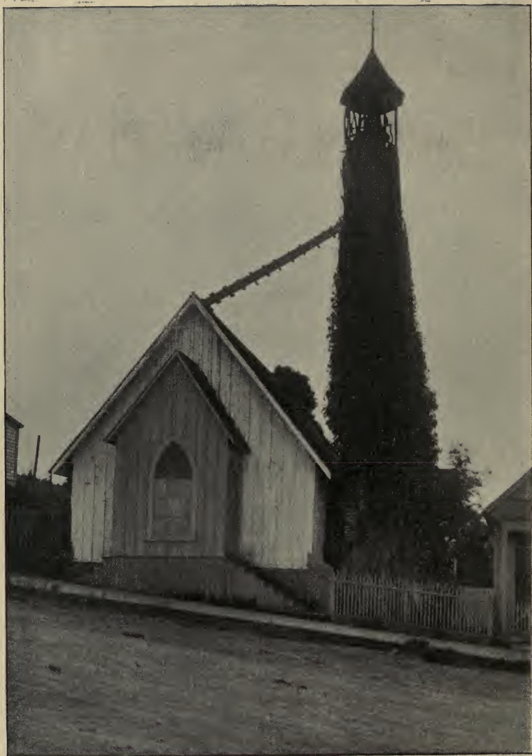
FIRST EPISCOPAL CHURCH ERECTED IN TACOMA, WASH. SEE PAGE 24.