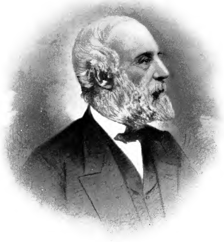
GENERAL ROBERT E. LEE