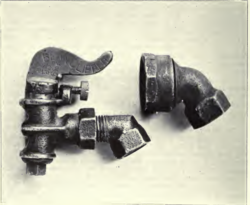
Nozzles of Bordeaux (flat spray) and circular spray line with angle.

Where the Bordeaux mixture is to be used in quantity it is advisable to make stock solution. To make a stock solution of copper-sulphate, put 20 gallons of water in a 40-gallon barrel; place in a sack (preferably of a coarse nature, such as a light bran-sack) 80 lb. of copper-sulphate (blue-stone); suspend this in the barrel so that the bottom of the sack is 5 or 6 inches under water. In a few hours, or at least a few days, the copper-sulphate will go into solution. Mark on the inside of the barrel the surface of the solution,