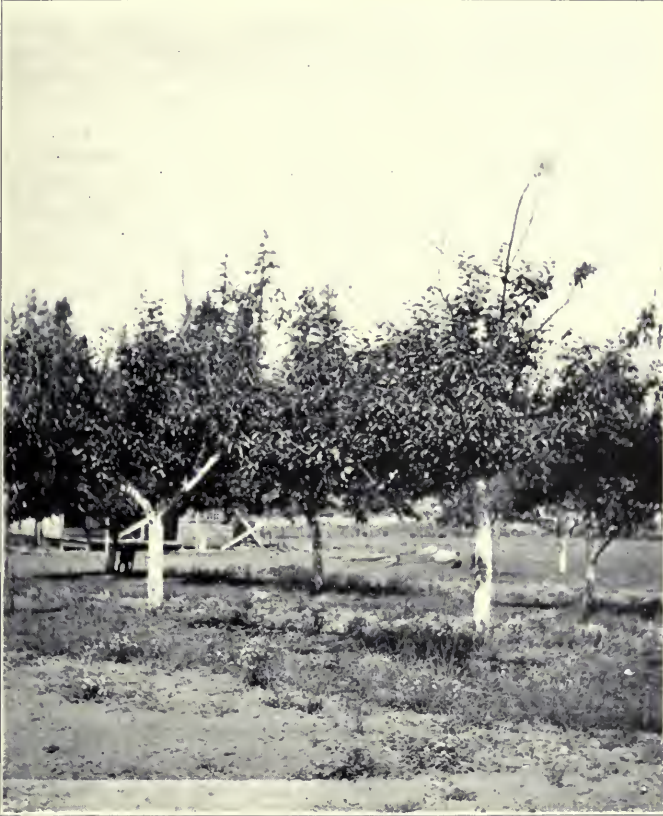
Trees badly attacked by black-spot cankers. Note dead limbs.

is the mycelium or "roots" of the fungus, similar to the white threads in the soil of a mushroom-bed. Black specks which appear later contain the spores or "seeds." The plant does not require leaves or chlorophyll (green colouring-matter), as it lives on plant-food already prepared by the host