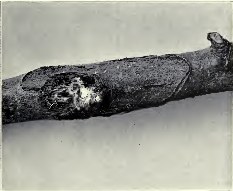
Black-spot canker on an apple-tree.