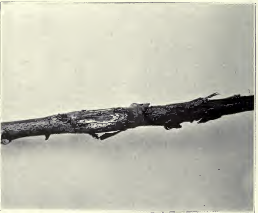
Limbs of apple-tree showing cankered area with subsequent attack of woolly aphids.

The disease attacks the apple-tree, causing injury to trunk, limbs, and fruit. Cankers similar in appearance have been found on the plum, prune, and cherry, but the writer is not aware that satisfactory proof has been found to positively connect the fungus with the canker, although they show a notable resemblance.