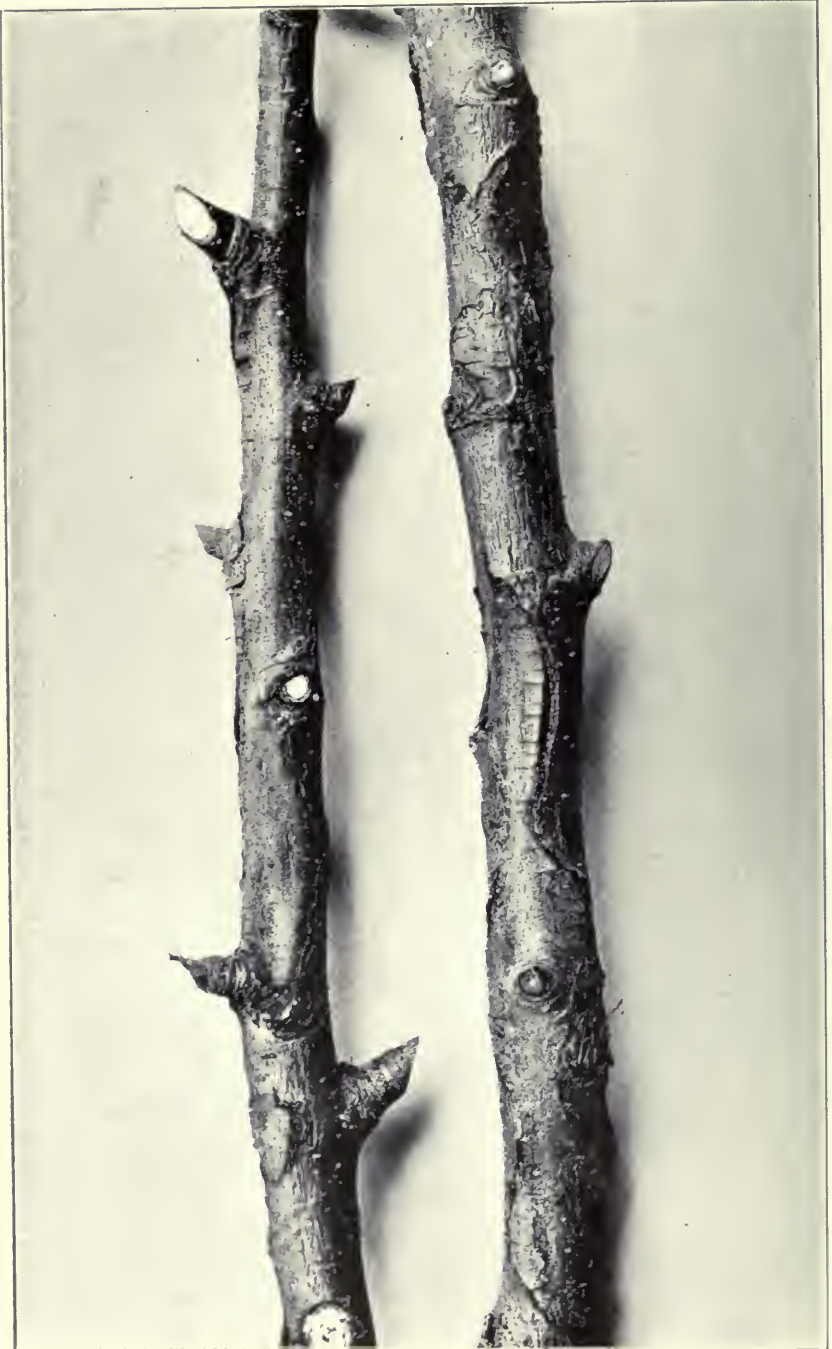
Limbs of apple-tree badly attacked by canker.