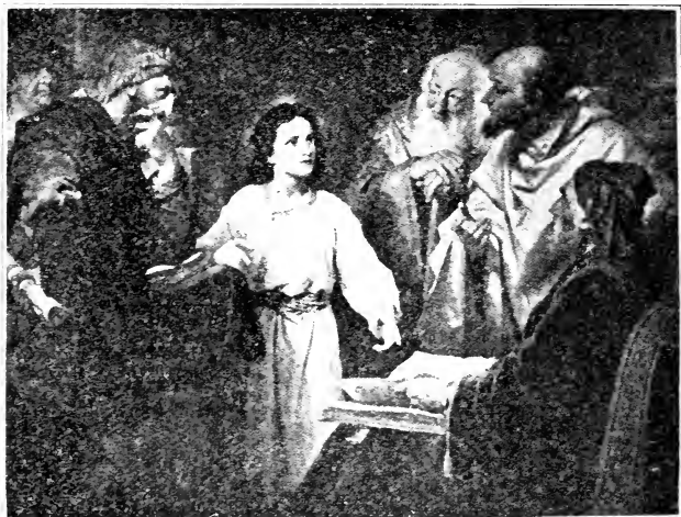
CHRIST AND THE DOCTORS

What preaching to boys on the principles of the Gospel could drive home a lesson more potently than this significant cut?