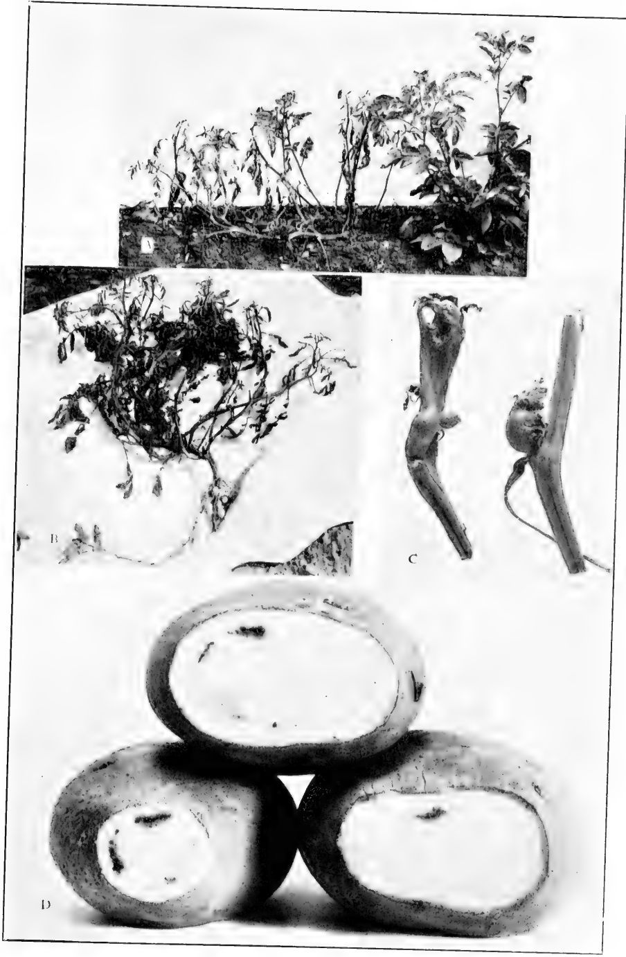
HASKELL: POTATO FUSARIUM WILT