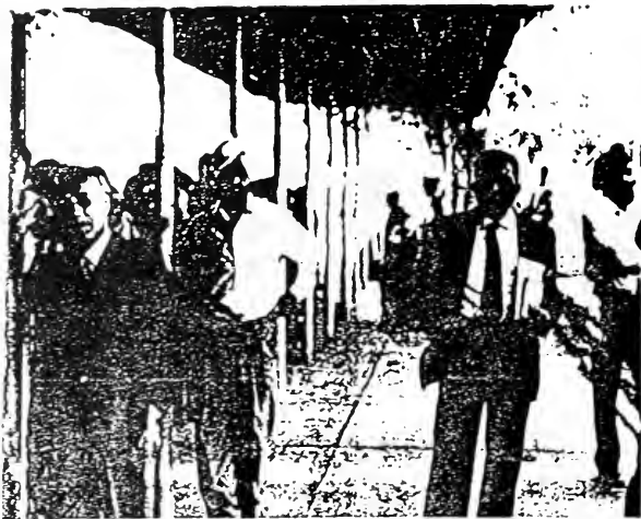
Visa applicants wait in New Delhi, February 1993.