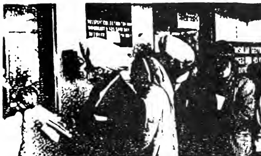
Visa applicants at Embassy New Delhi: Consular officers no longer exercise much foreign-policy discretion.

office. (The consular officer or the department can recommend or refuse to recommend a waiver.) Meanwhile, the alien sits and waits. Our proposal would permit the waiver to be adjudicated on the spot, seeking guidance from the (newly created) Immigration and Refugee Agency if necessary.