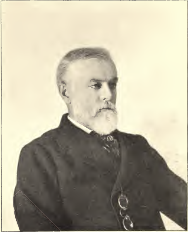
GENERAL ROY STONE

[Father of the good-roads movement in the United States]