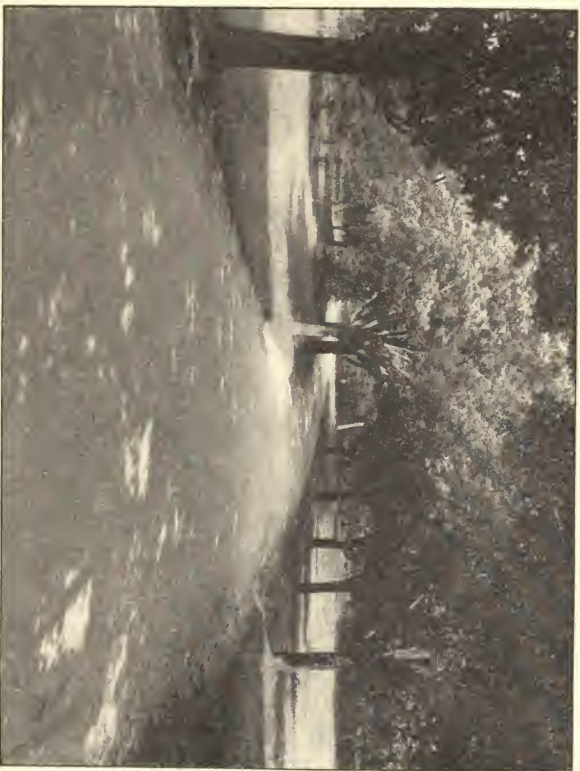
GRAVEL ROAD NEAR SOLDIERS' HOME, DISTRICT OF COLUMBIA