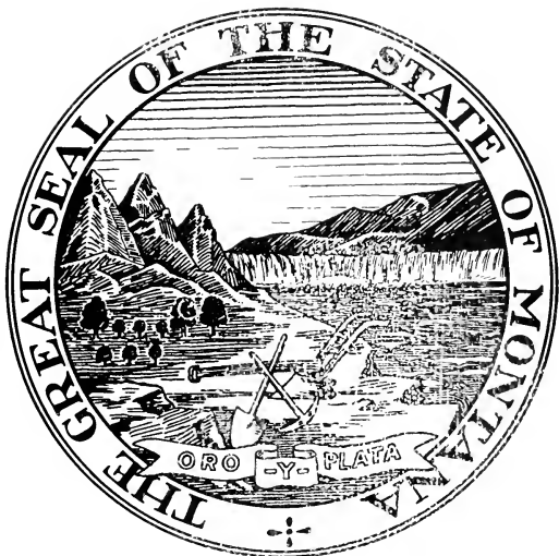
GREAT SEAL STATE OF MONTANA