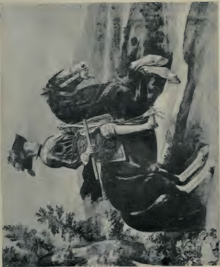
PHILIP IV., KING OF SPAIN. From the painting by Velasquez.