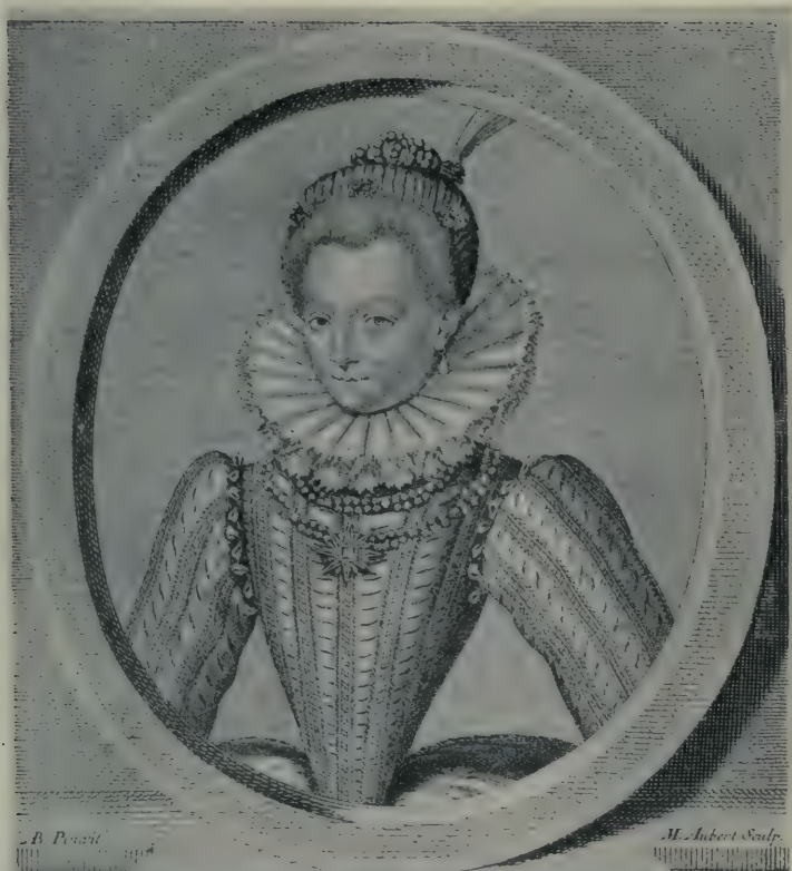
HENRIETTE DE BALSAC. Marquise de Verneuil. Morte en 1633. en sa 54. Année.