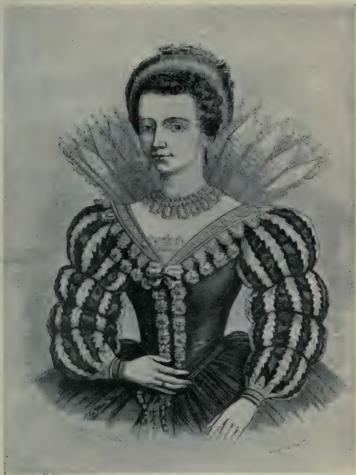
CHARLOTTE MARGUERITE DE MONTMORENCY, PRINCESSE DE CONDÉ.