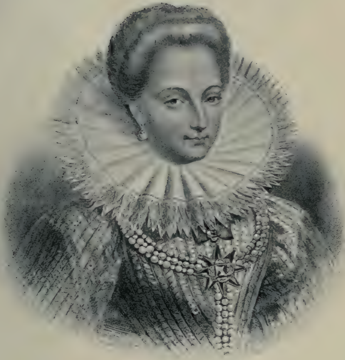
GABRIELLE D'ESTRÉES, DUCHESSE DE BEAUFORT.