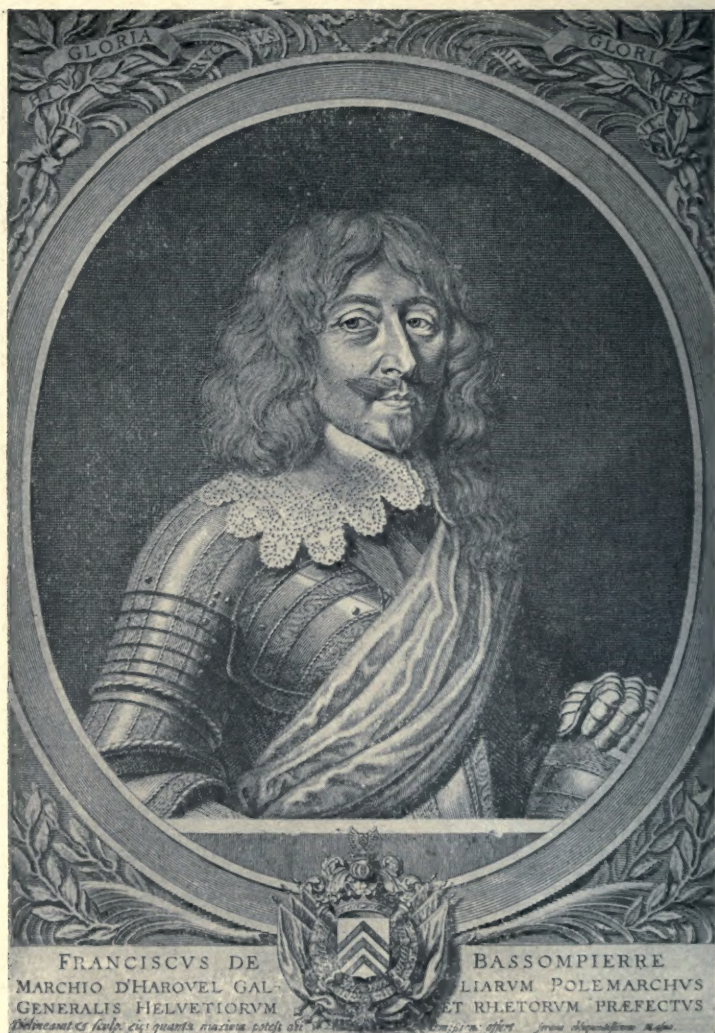
FRANÇOIS, SEIGNEUR DE BASSOMPIERRE, MARQUIS D'HAROUEL, MARÉCHAL DE FRANCE.