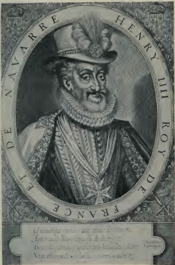
HENRI IV., KING OF FRANCE.