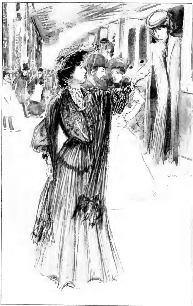
"SHE DREW BACK QUICKLY AS THE REST OF THE PARTY CAME HURRYING TO THE CARRIAGE."