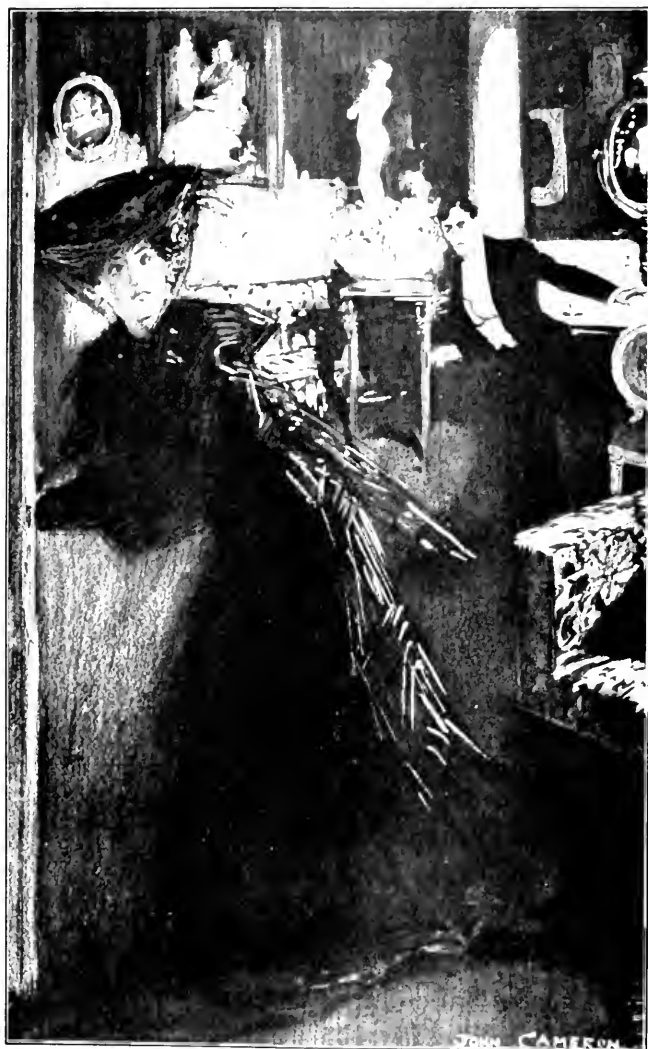
SHE WAS SPEDING DOWN THE LONG CORRIDOR TO THE STAIRS.