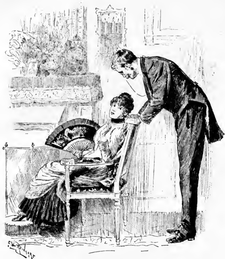
“SHE LOOKS FONDLY UP INTO THE FACE OF HER HUSBAND FOR APPROVAL.”