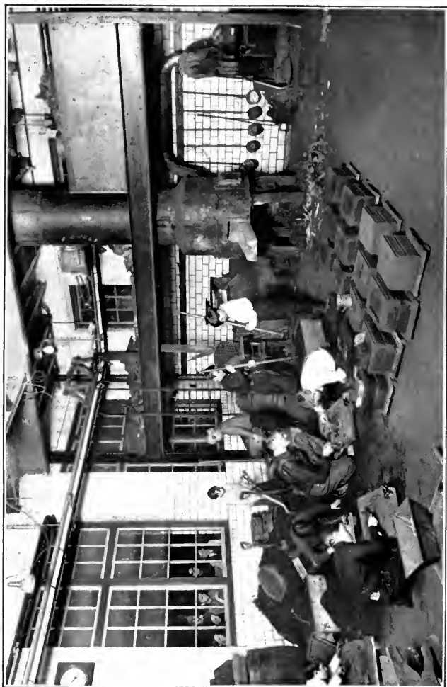
THE FOUNDRY AT THE EMERSON SCHOOL

Notice group of curious children at window