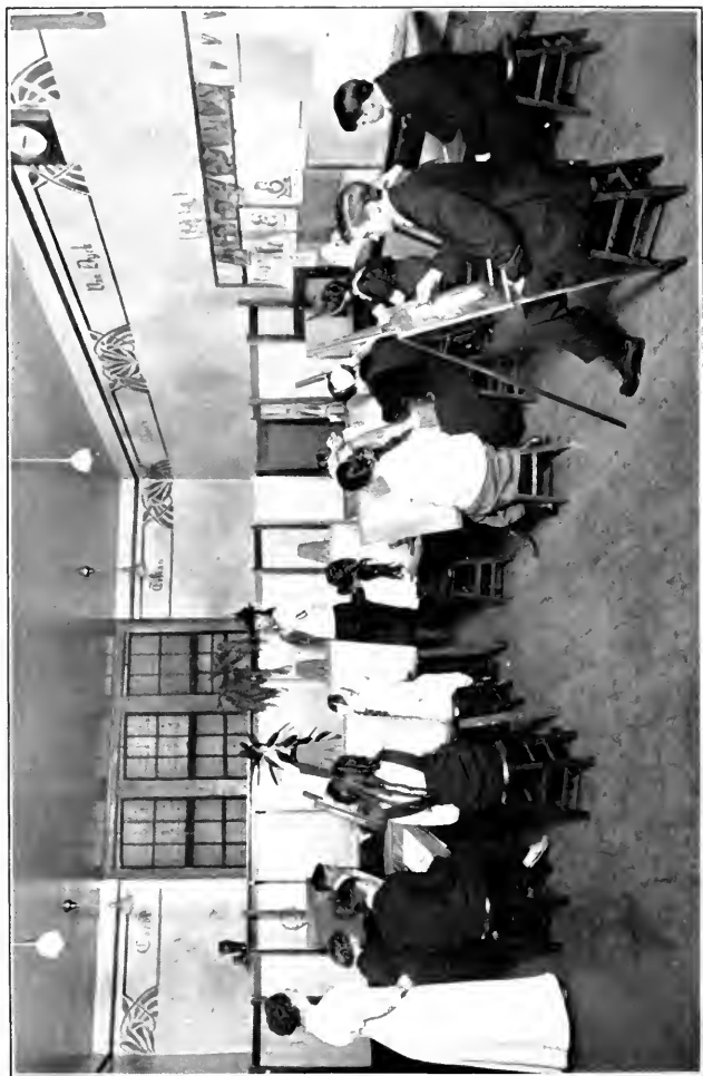
DRAWING FROM A MODEL AT THE EMERSON SCHOOL

Notice frieze on wall designed and painted by the children themselves