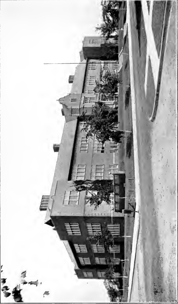
THE EMERSON SCHOOL