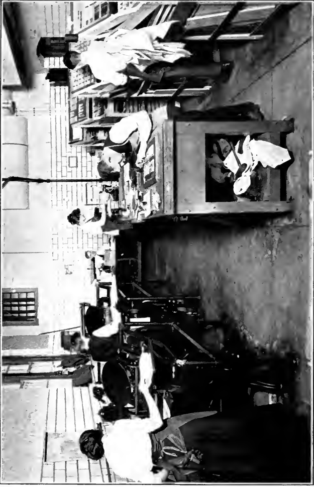
THE PRINTING SHOP AT THE EMERSON SCHOOL