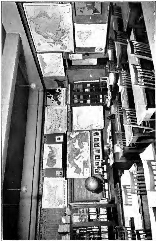
THE HISTORY ROOM AT THE EMERSON SCHOOL