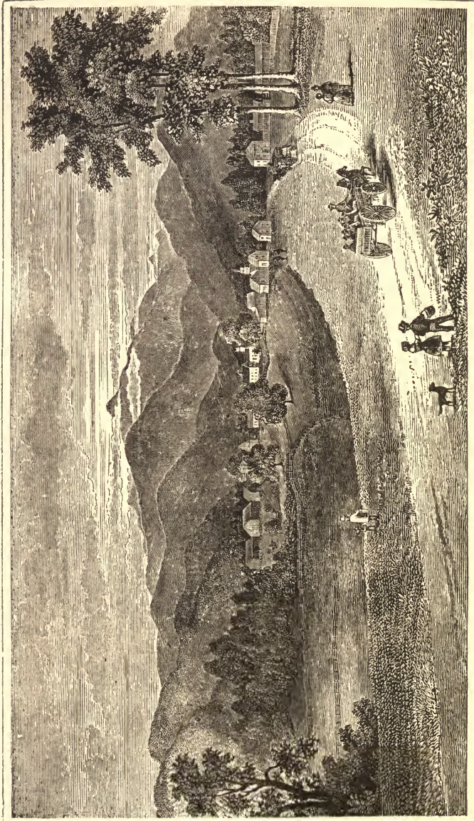
MOUNT WASHINGTON. NORTH CONWAY.