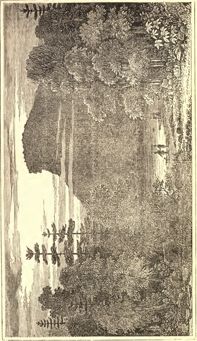
THE OLD MAN OF THE MOUNTAIN.