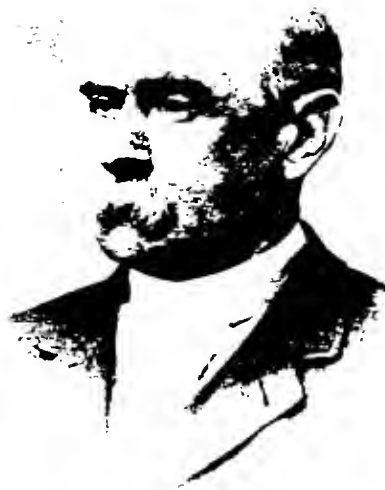
HON. CHARLES FRANCIS ADAMS, 2D, LL.D.