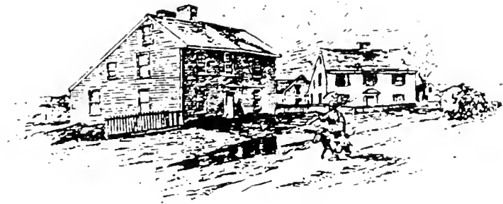
OLD ADAMS HOUSES AT QUINCY, MASS.