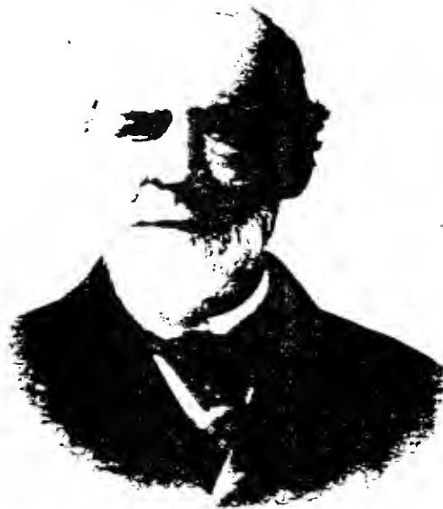
HON. WILLIAM CLAFLIN, LL.D