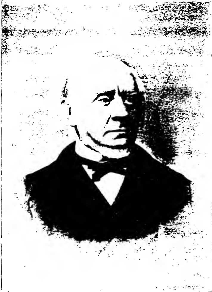
HON. CHARLES FRANCIS ADAMS, LL.D.