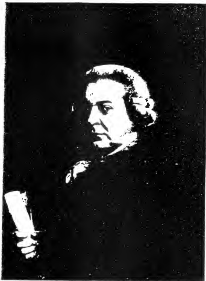
HON. JOHN ADAMS, LL.D