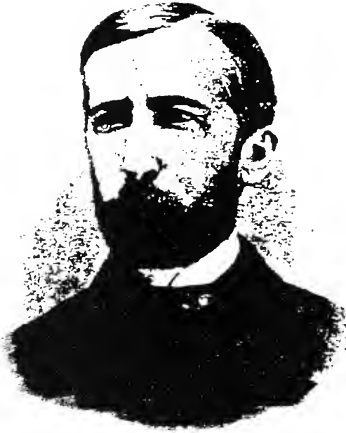
JOHN QUINCY ADAMS. 1