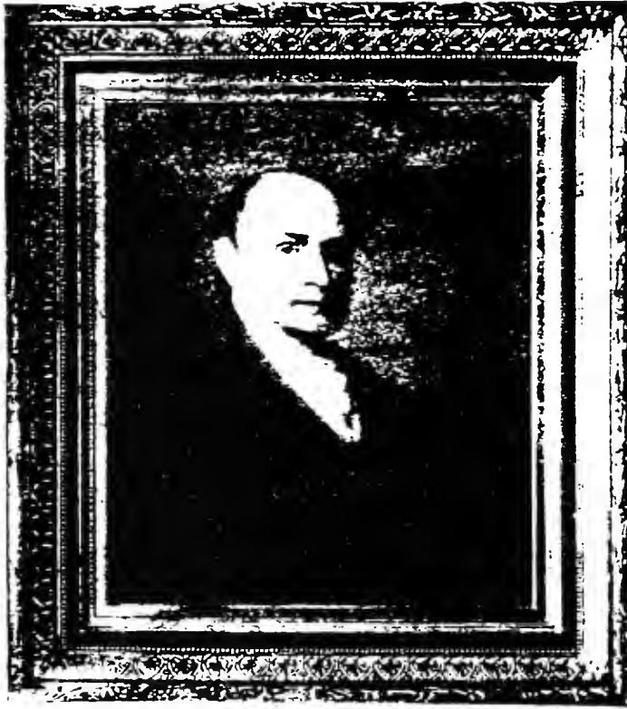
HON. JOHN QUINCY ADAMS, LL.D.

President of the United States, 1825-1829.