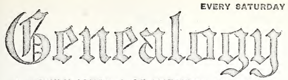
A WEEKLY JOURNAL OF AMERICAN ANCESTRY

Vol. 2, No. 16 New York, October 19, 1912 Whole No. 42