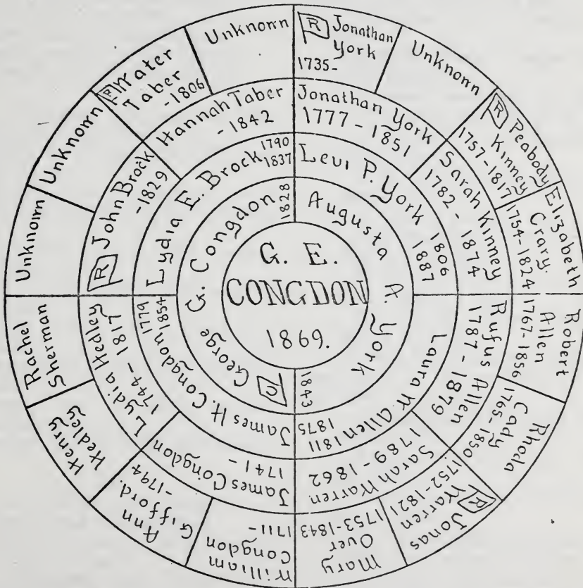
The Congdon Ancestral Chart