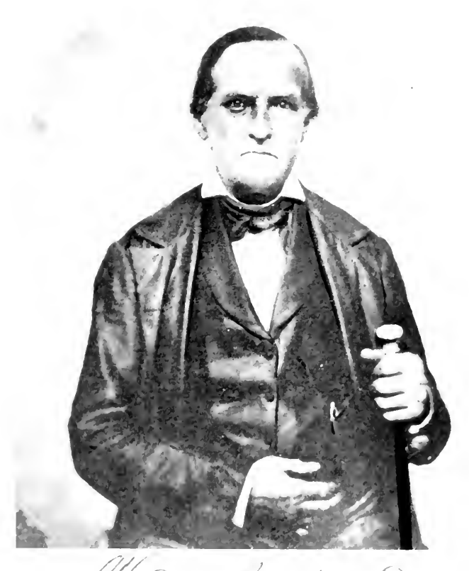
Mender Bruken ridge