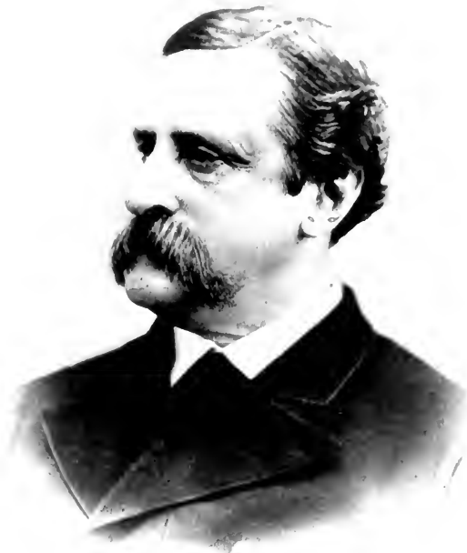
THE HON. JOHN THOMPSON HOFFMAN.