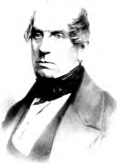
THE HON. OGDEN HOFFMAN.