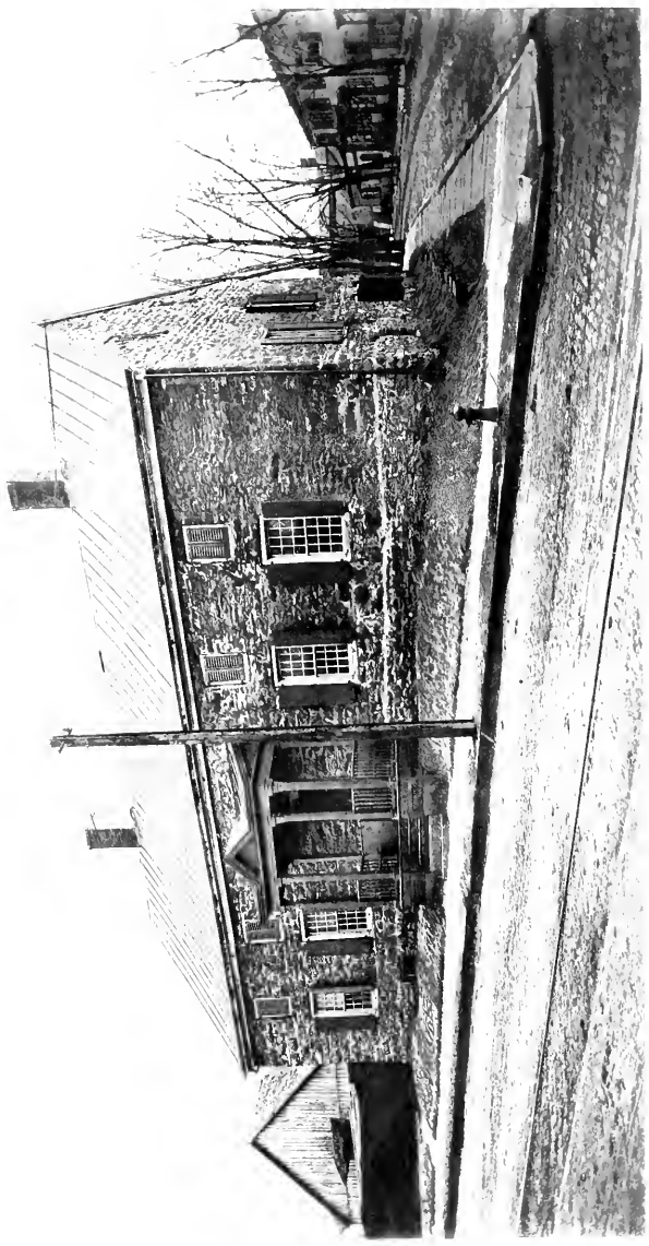
OLD HOUSE IN KINGSTON.