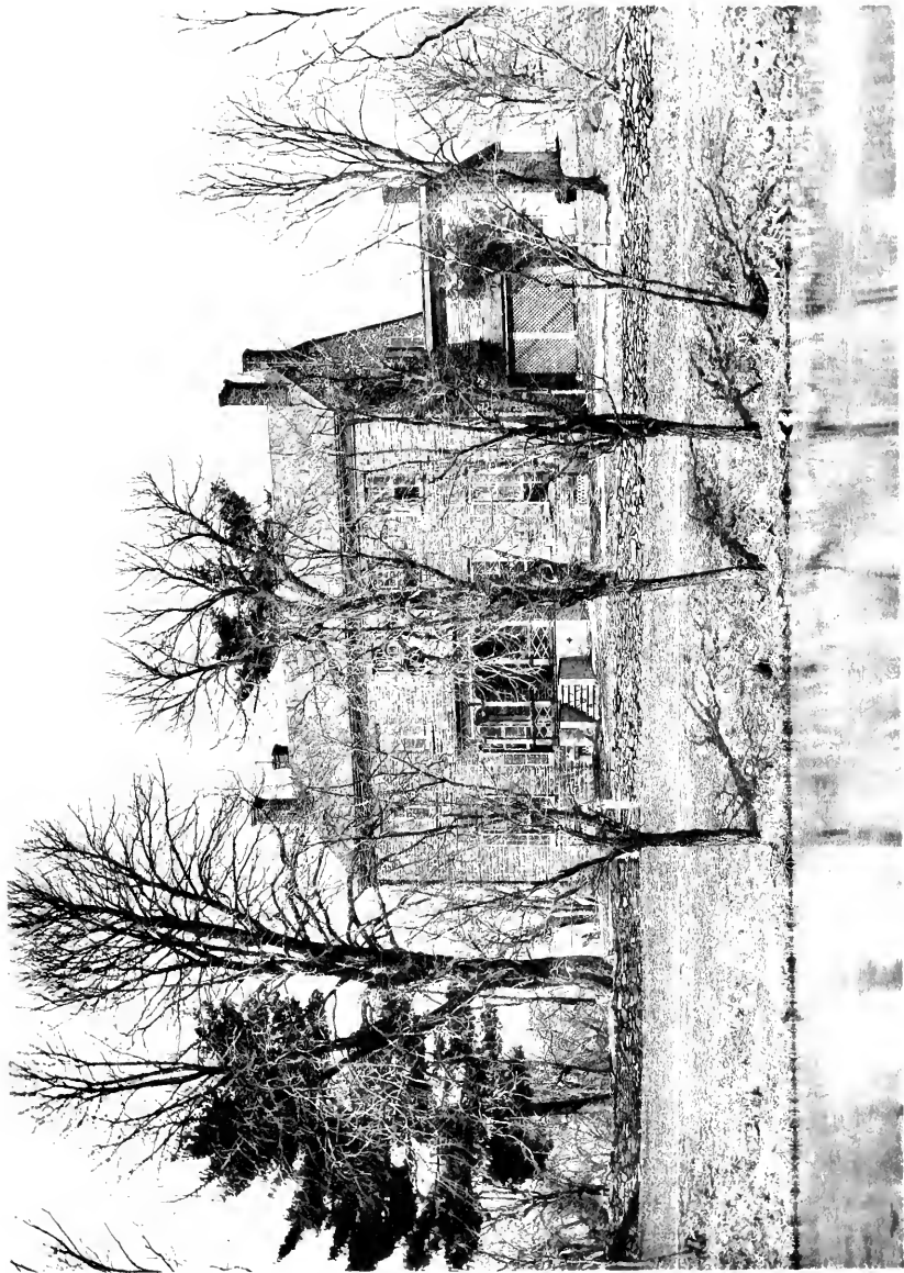
HOUSE NEAR UPPER RED HOOK, N. Y.