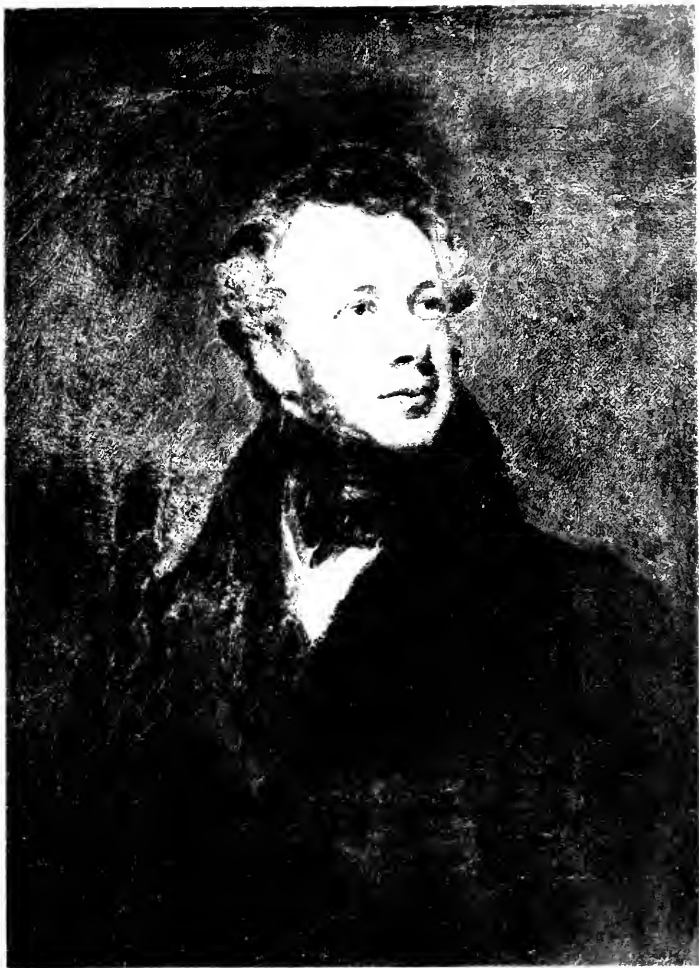
CHARLES FENNO HOFFMAN.