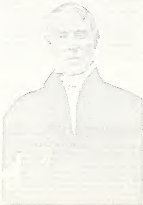
HON. ACHILLES WILLIAMS