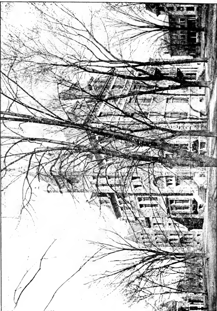
LANE THEOLOGICAL SEMINARY.