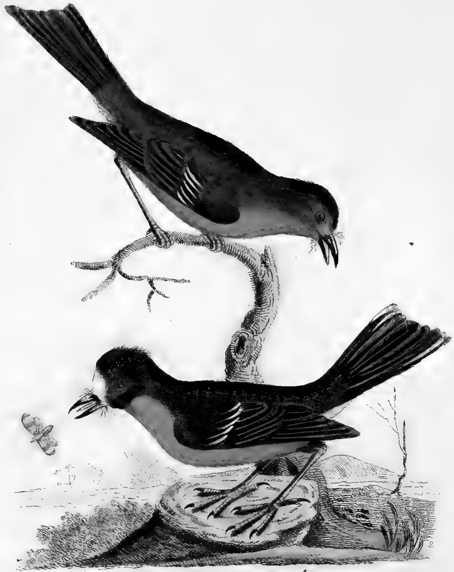
Red bellied Flycatchers.