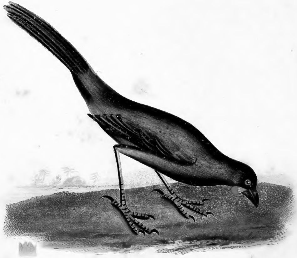
Cincereous Wattle Bird.