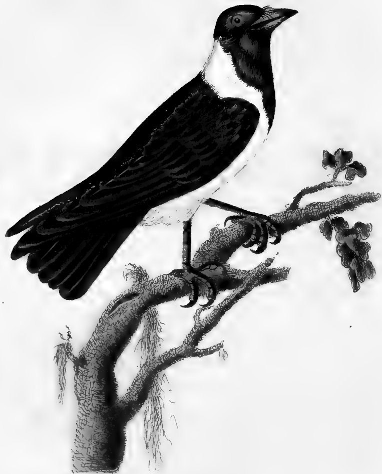
White Breasted Crow.