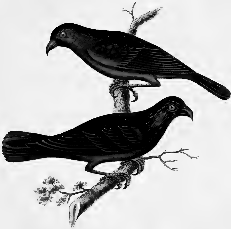
Blue striped Robber.