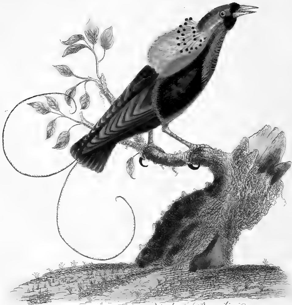
Magnificent Bird of Paradise.