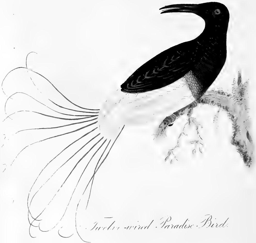
Twelve-winged Paradise Bird.