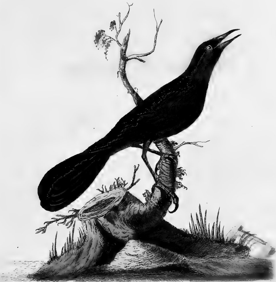
Boat tailed Grackle.