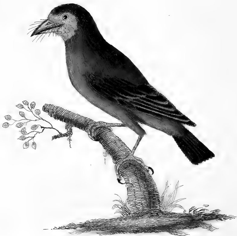
Puff faced Barbet.