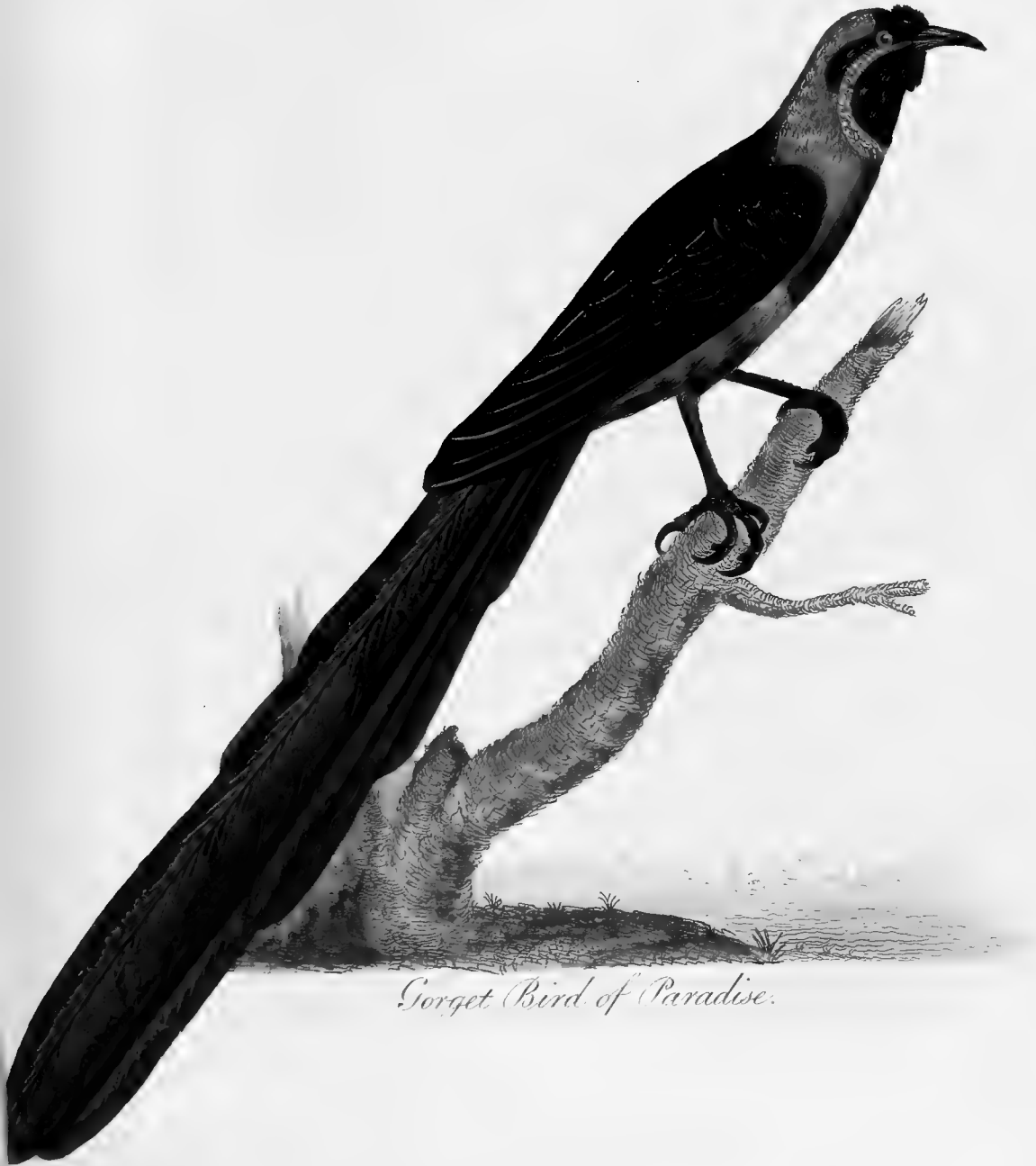
Gorget Bird of Paradise.