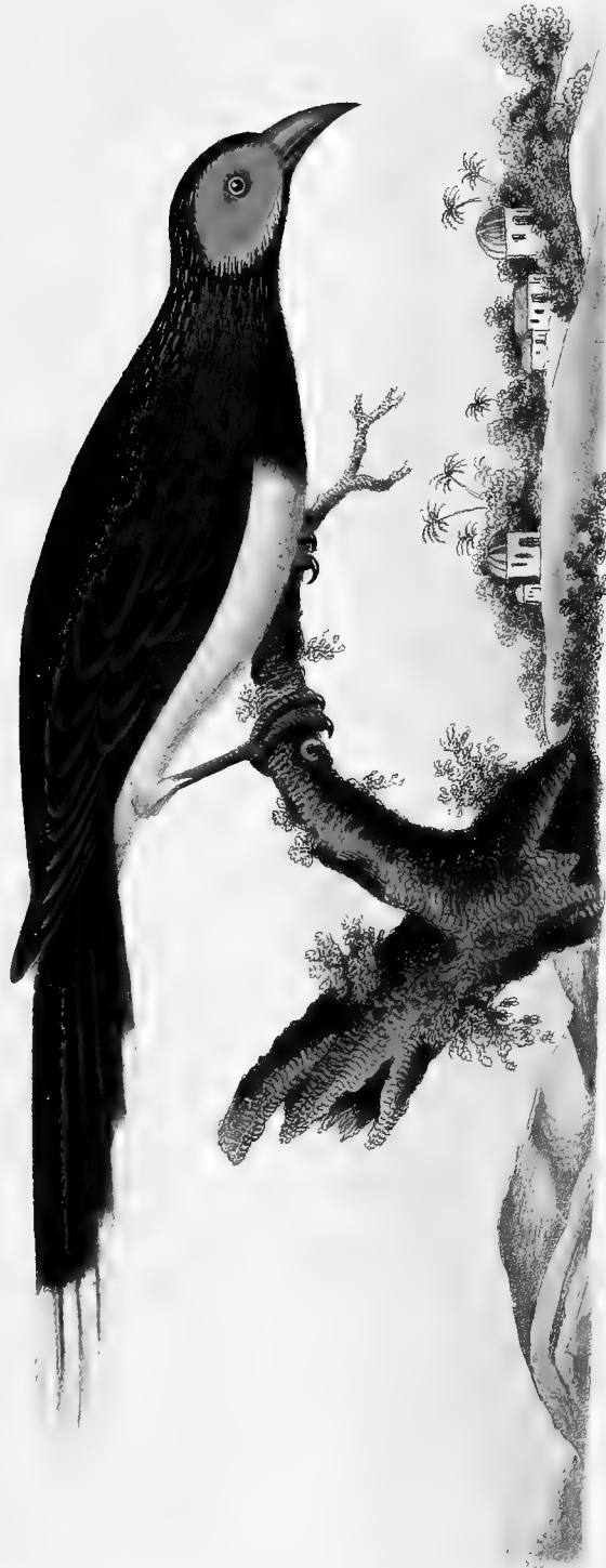
THE RED TAIL TROPICBIRD.