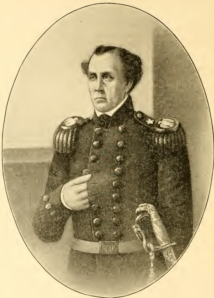
REAR ADMIRAL JOHN DRAKE SLOAT, U. S. N.