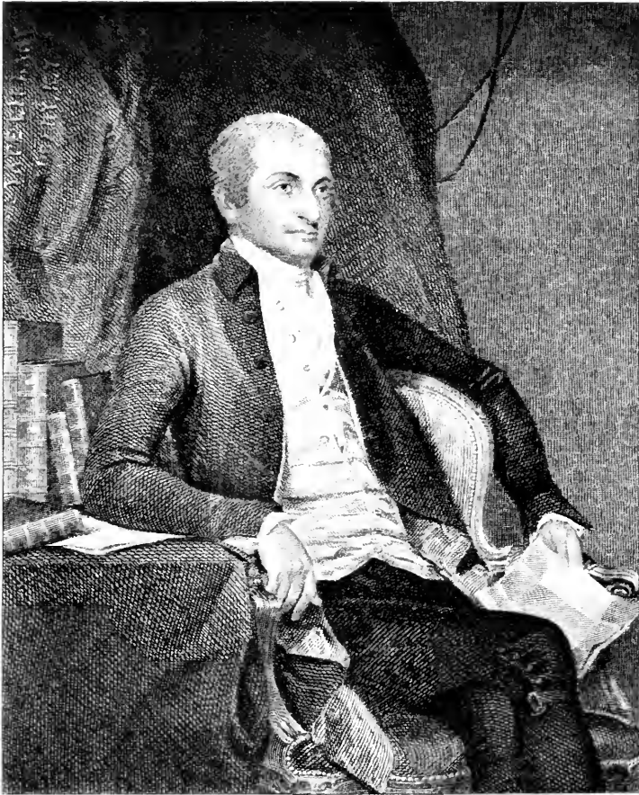
John Jay —