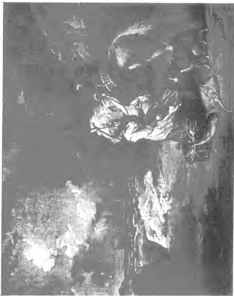
SELLING FISH. By George Morland. Engraved by John Raphael Smith, 1799.