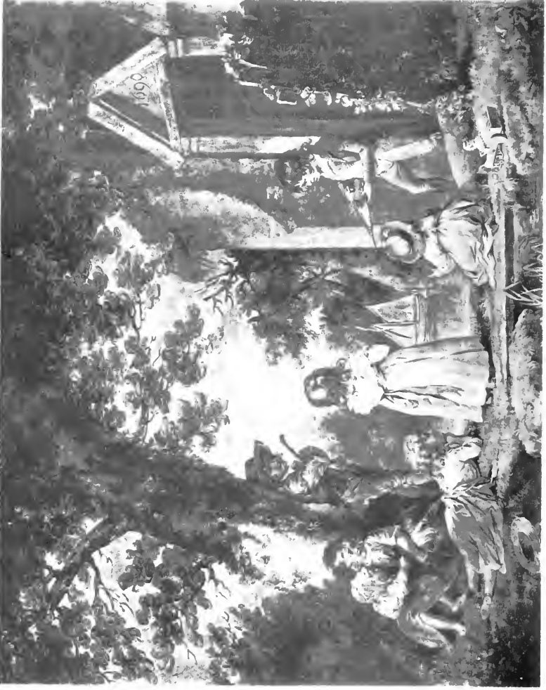
JUVENILE NAVIGATORS. By George Morland. Engraved by William Ward, 1789.