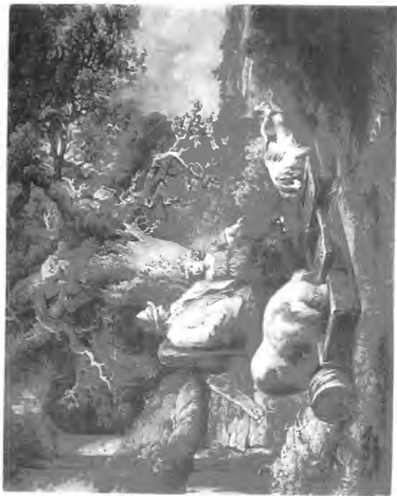
PLEASANT AND PIGS. Engraved by John Raphael Smith, 1791.