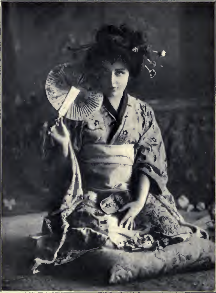
"ADORABLE, UNFORGETTABLE BLOSSOM OF JAPAN"