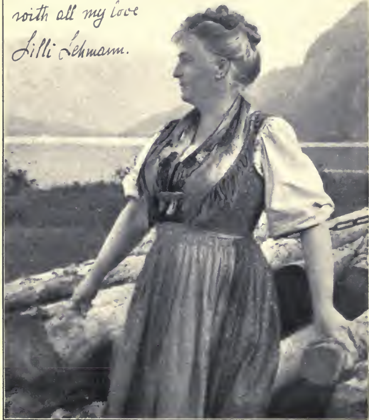
"BEAUTIFUL LILLI LEHMANN, STATELY AND SERENE"

To my dearest child Gerardine Farrar with all my love Lilli Lehmann.