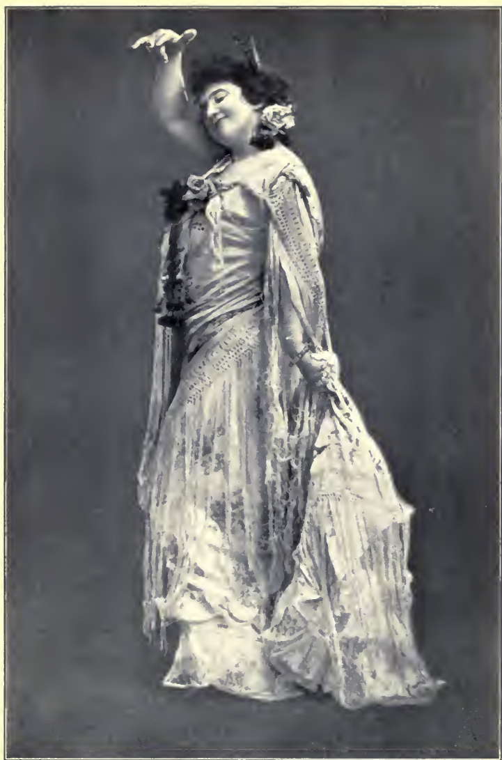
CALVÉ AS CARMEN