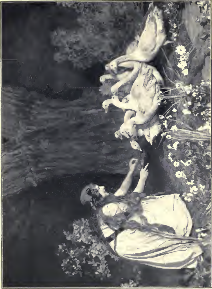
THE GOOSE GIRL AND HER FLOCK