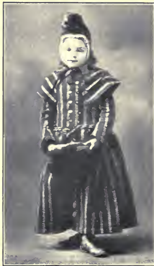
A LITTLE GIRL IN MELROSE