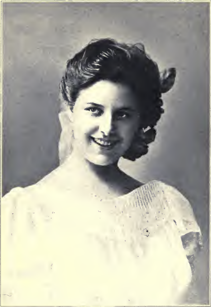
A YOUNG GIRL WITH A PHENOMENAL SOPRANO VOICE