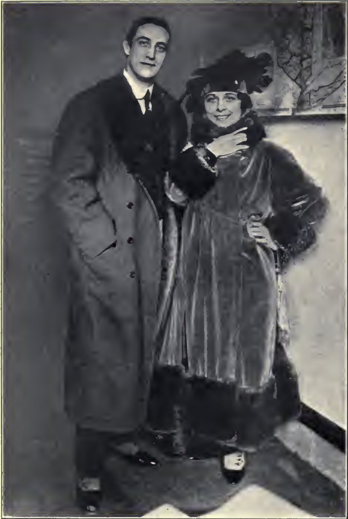
MISS FARRAR AND MR. LOU TELLEGEN