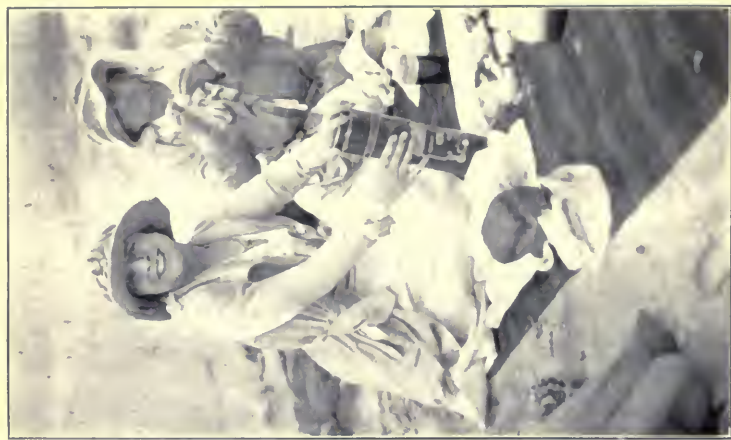
MAKING NEW FRIENDS IN THE "MOVIES"