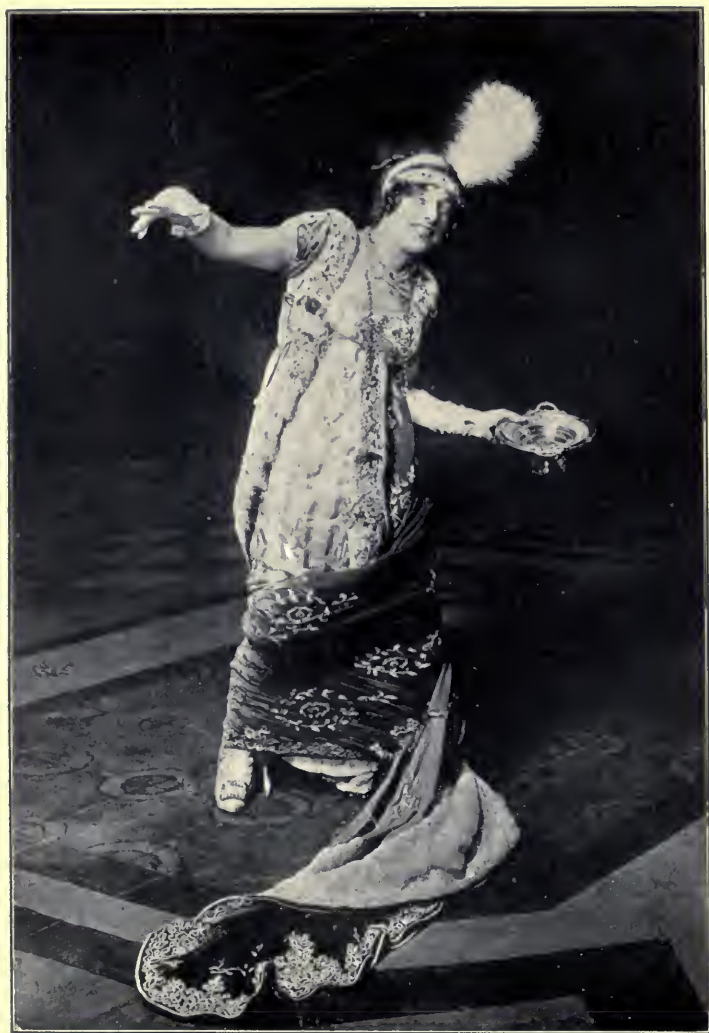
"THE AMUSING MADAME SANS GÊNE"