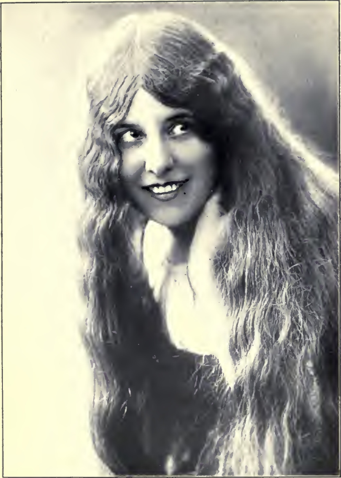
THE GOOSE GIRL IN "KÖNIGSKINDER"