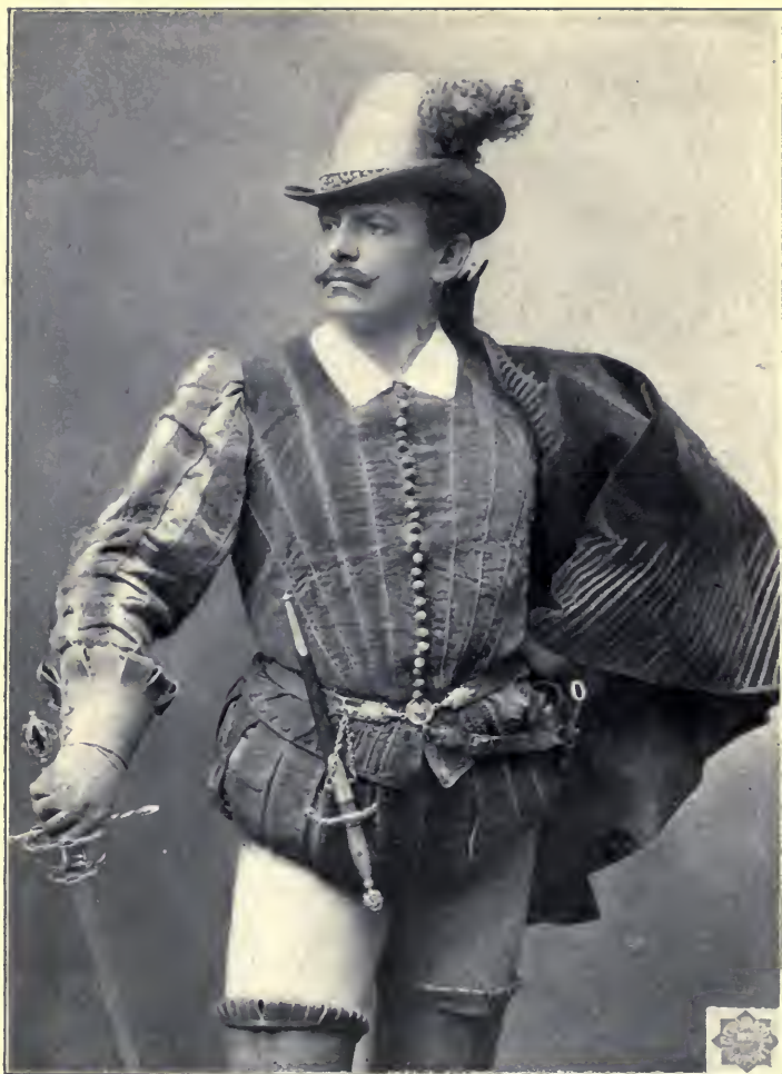
JEAN DE RESZKE