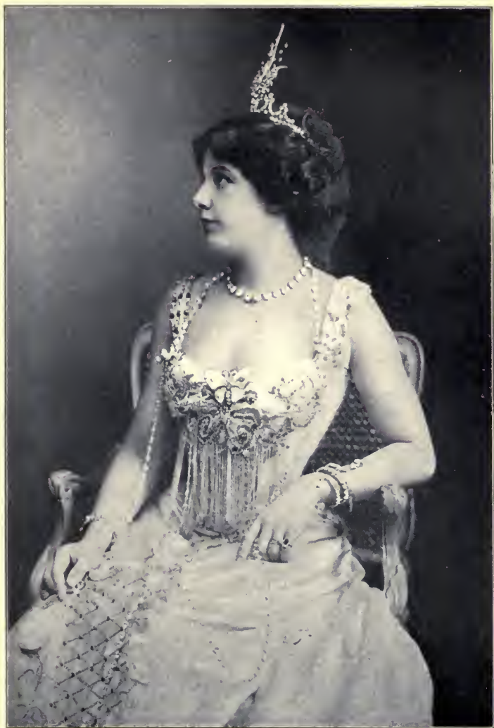
"MY THIRD SEASON OPENED IN TRAVIATA"