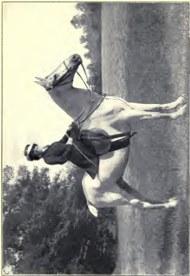
"I SPENT THE SUMMER IN BRITANY"