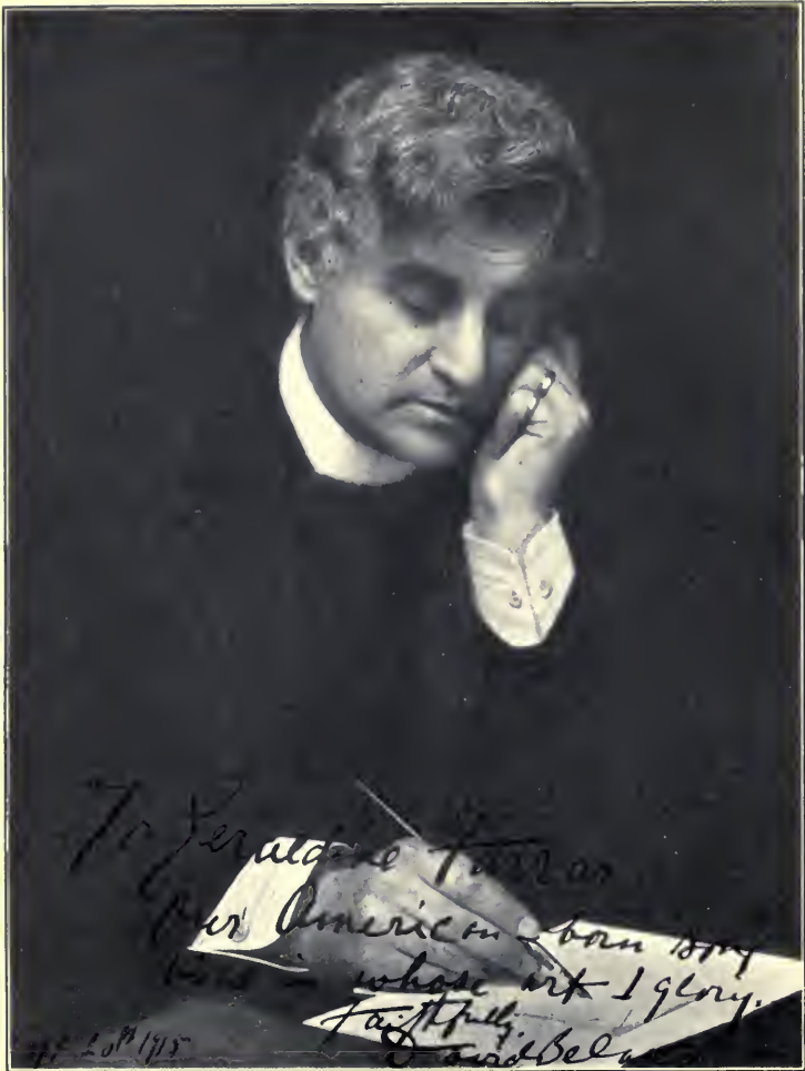
BELASCO, "THAT PAST MASTER OF STAGECRAFT"