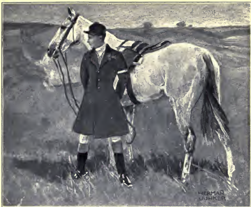
THE CROWN PRINCE OF GERMANY