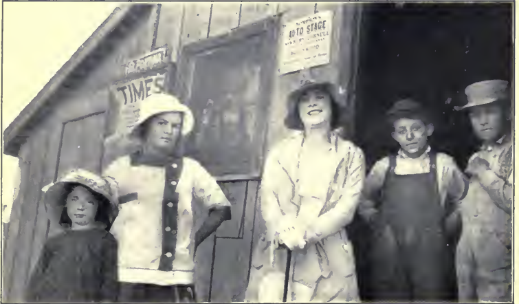
WORK AND PLAY IN CALIFORNIA