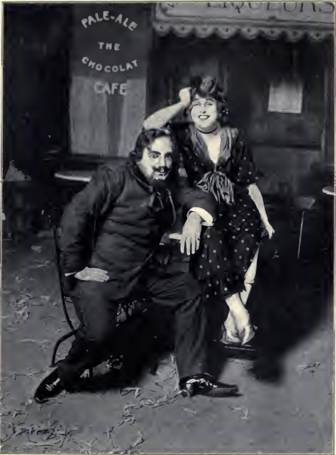
MISS FARRAR AND CARUSO IN "JULIAN"