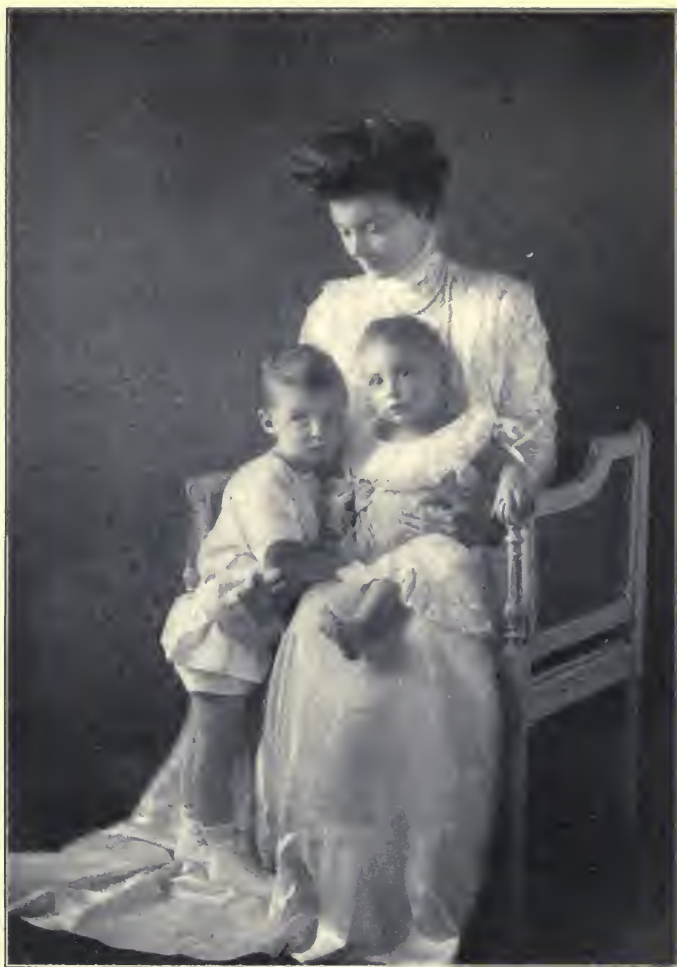
THE CROWN PRINCESS OF GERMANY