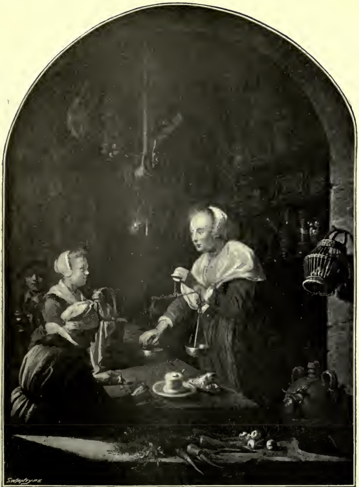
THE GROCERS' SHOP