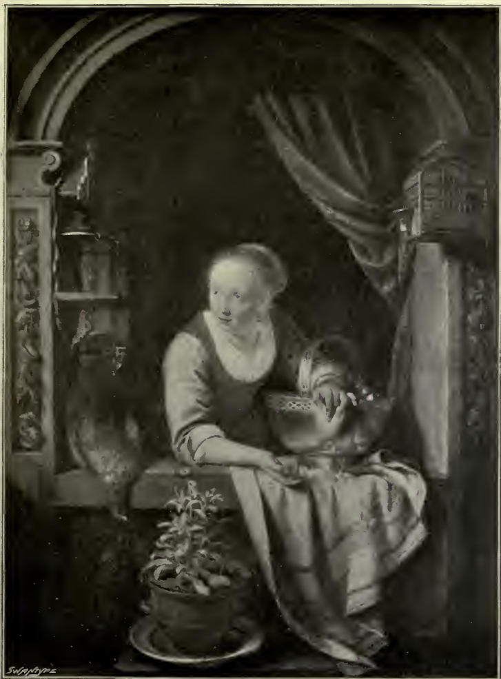
GIRL AT A WINDOW