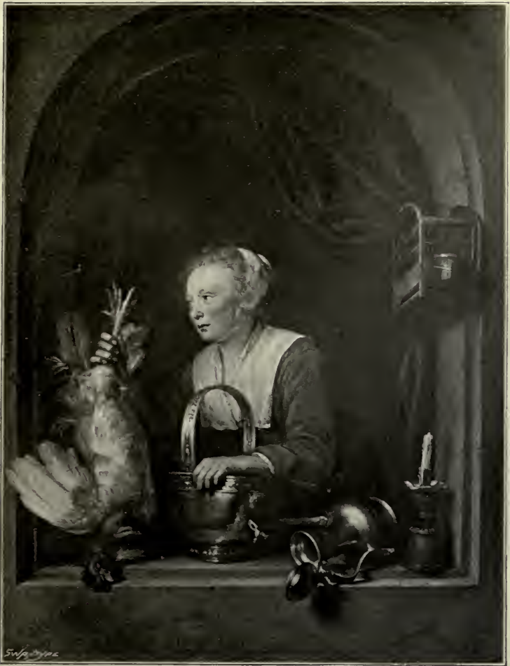
WOMAN WITH A DEAD FOWL