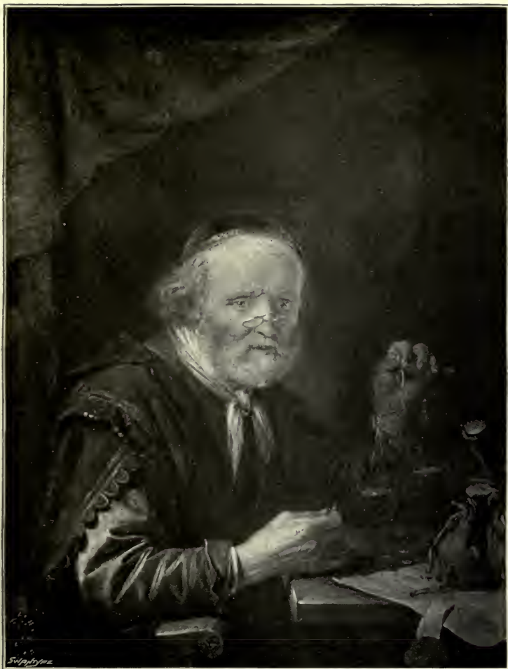
MAN WEIGHING GOLD