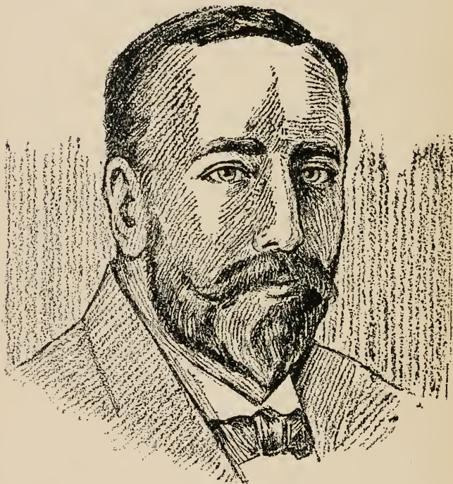
DR. BERNHARD DERNBURG

WHOSE MASTERLY EXPOSITION OF GERMANY'S JUST CAUSE HAS ANGERED THE AMERICAN TORIES