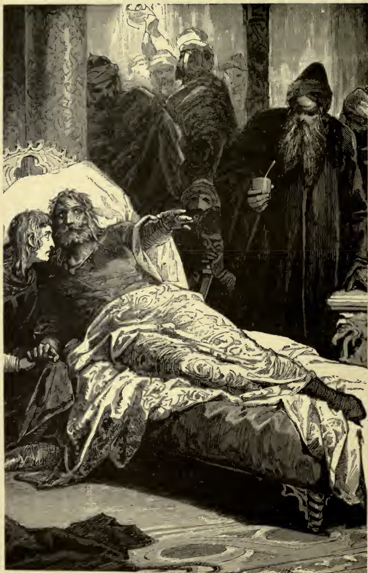
DEATH OF FREDERICK II AT PALERMO