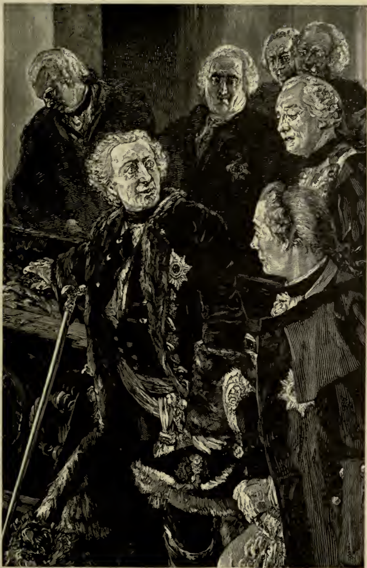
FREDERICK THE GREAT AT THE COFFIN OF THE GREAT ELECTOR