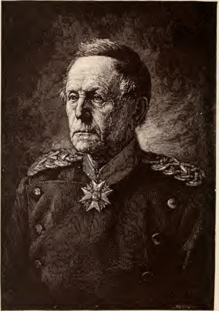
GENERAL VON MOLTKE