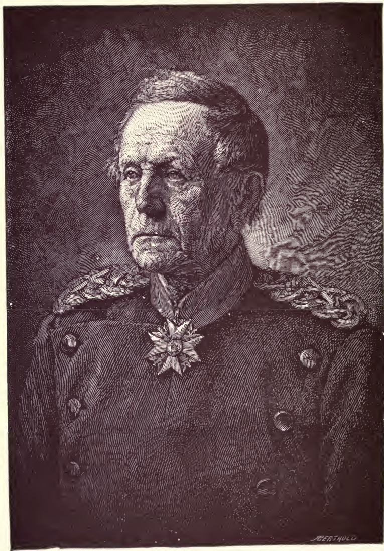
GENERAL VON MOLTKE