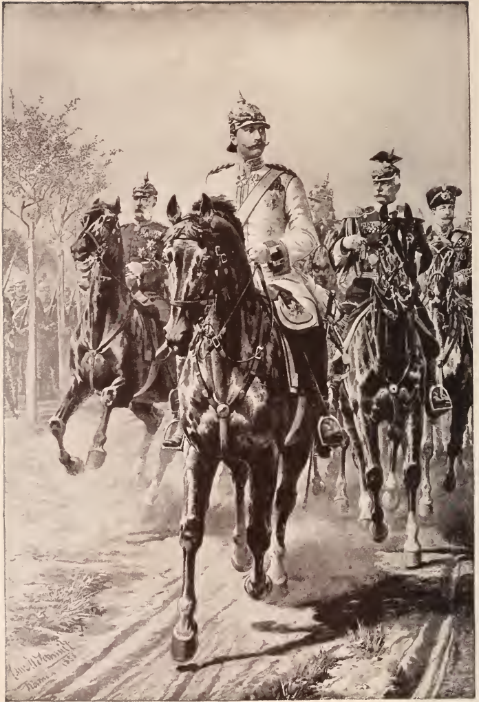
EMPEROR WILLIAM II.