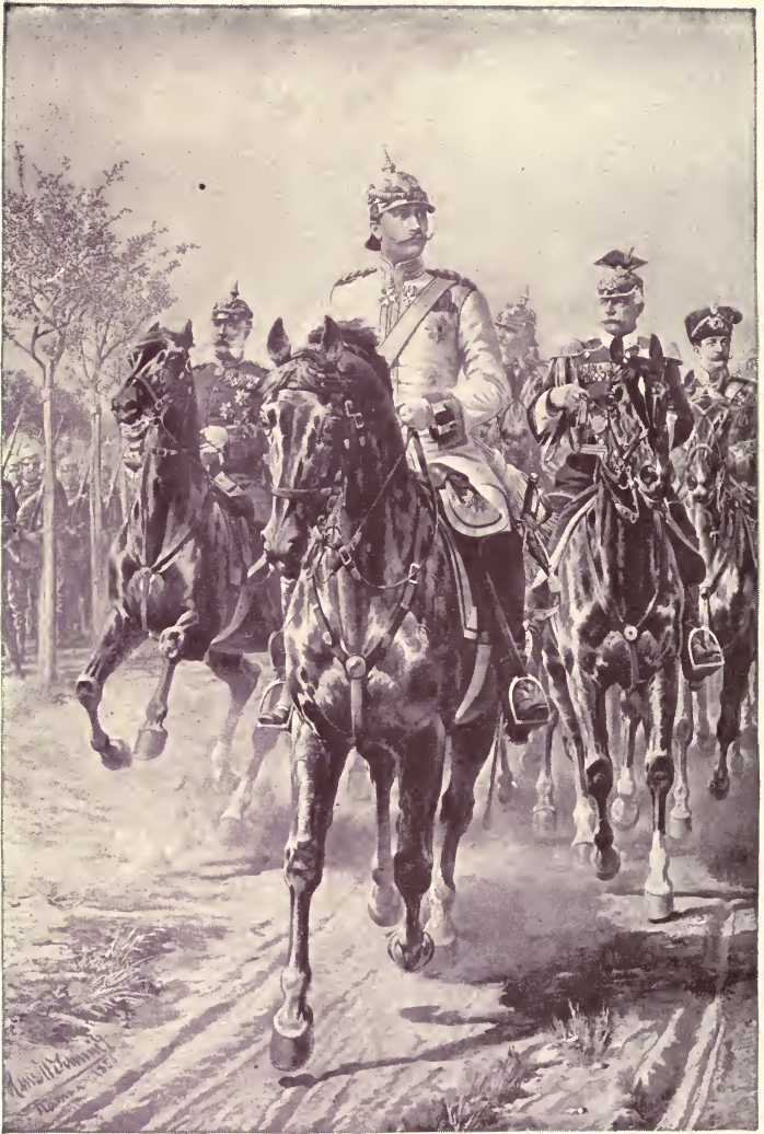
EMPEROR WILLIAM II.