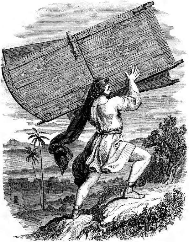
SAMSON CARRYING THE GATES OF GAZA.