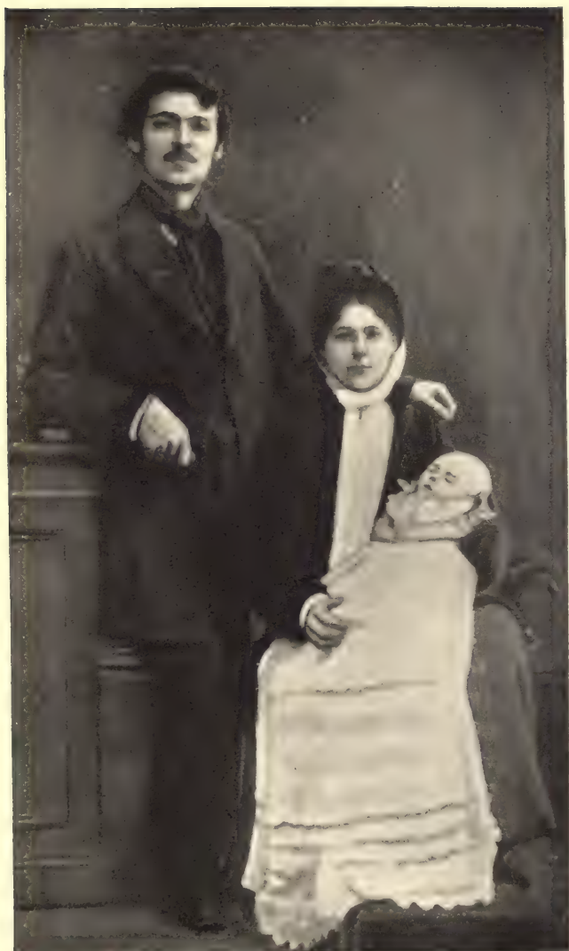
MY WIFE AND MY FIRST-BORN.