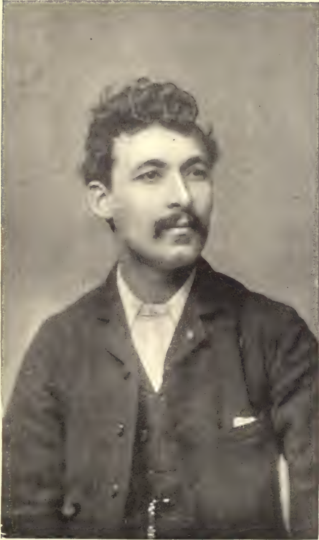
AT THE AGE OF TWENTY-SIX.