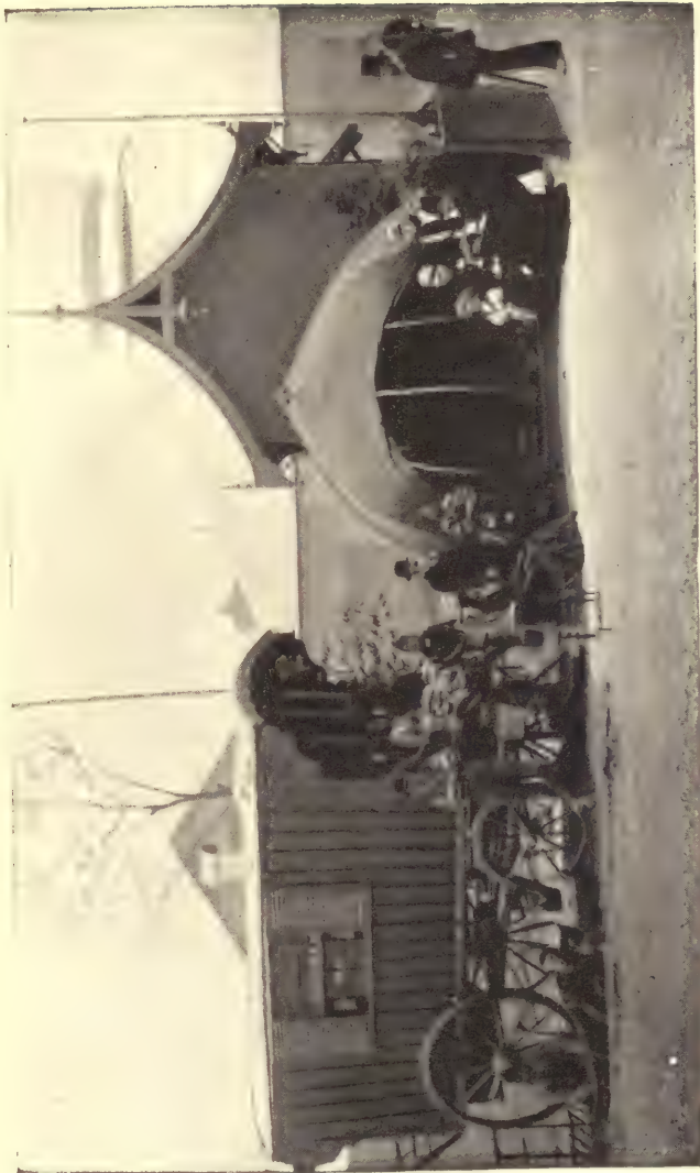
THE WAGON IN WHICH MY MOTHER DIED