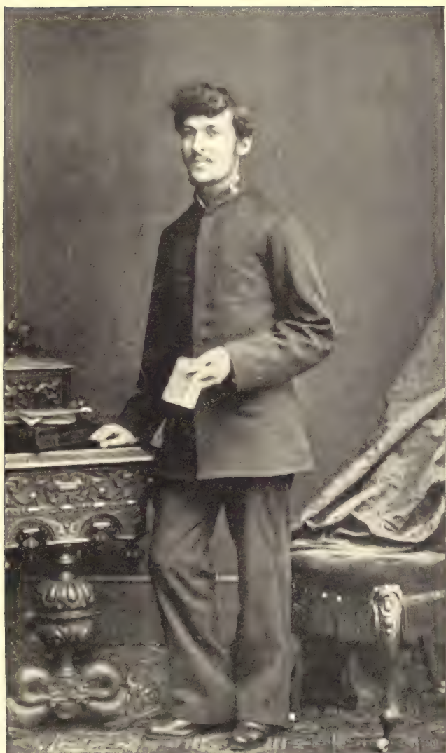
CAPTAIN GIPSY SMITH, OF THE SALVATION ARMY.