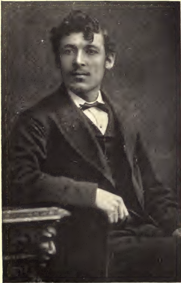
AT THE TIME OF MY MARRIAGE.