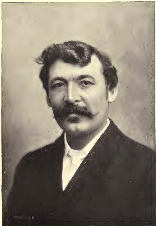
TAKEN DURING MY MISSION IN WOLVERHAMPTON. October, 1896.