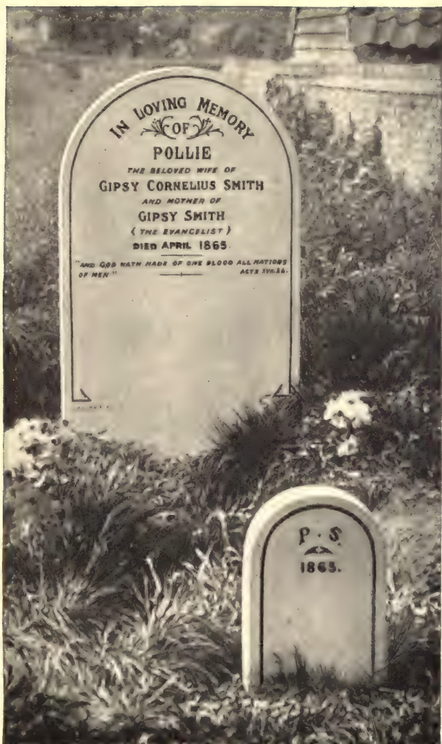
MY MOTHER'S GRAVE IN NORTON CHURCHYARD.