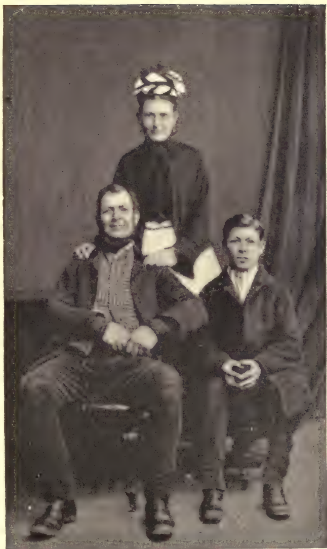
MY FATHER, MY SISTER, AND MYSELF.