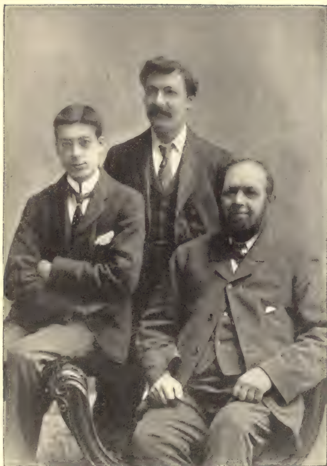
THREE GENERATIONS. My Father, Myself, and My Younger Son.