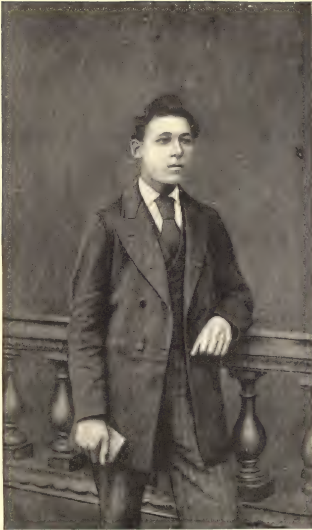
IN MY FIRST FROCK COAT.