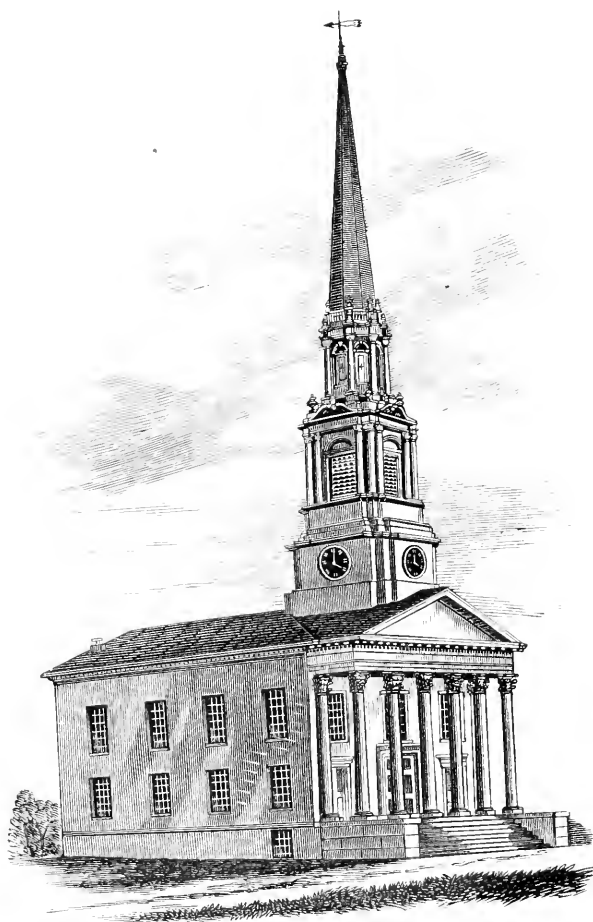
THIRD MEETING-HOUSE OF THE SECOND PARISH. DEDICATED MARCH 26, 1851.