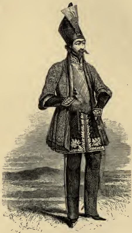
Nasr-ood-deen, the Shah of Persia.