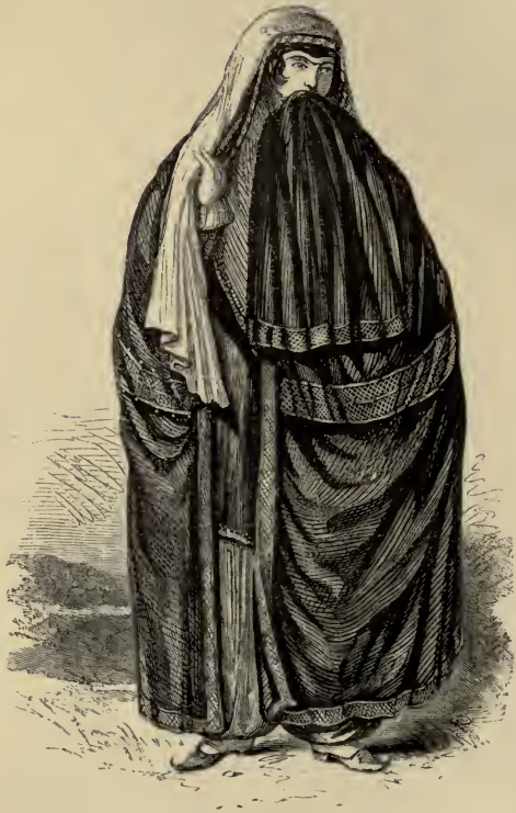
Persian Lady in Walking Costume.