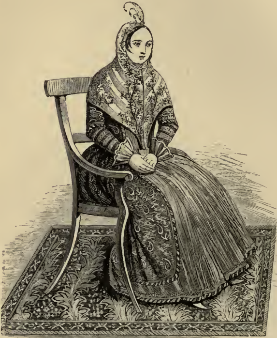
Persian Lady receiving a European Lady.