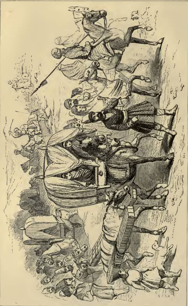
Caravan of Pilgrims, with Corpses, going to Kербella