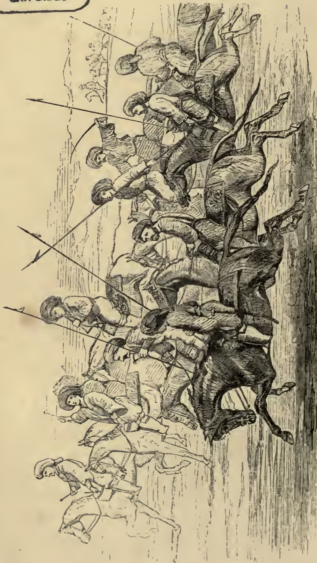
Kurds charging, with Kettle-drummers leading.