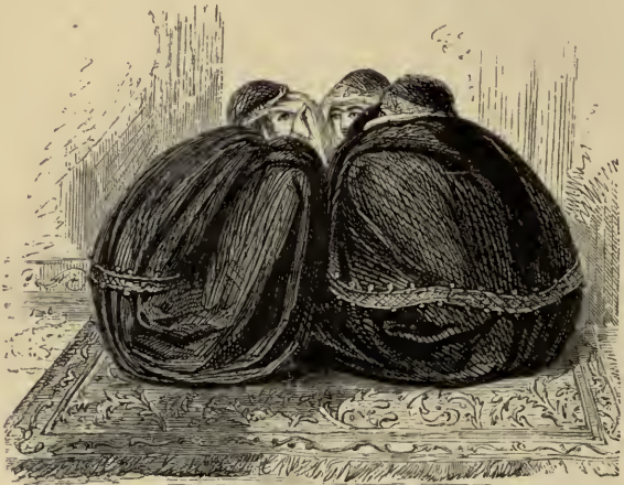
Persian Women seated on a carpet gossiping outside the Doctor's door.