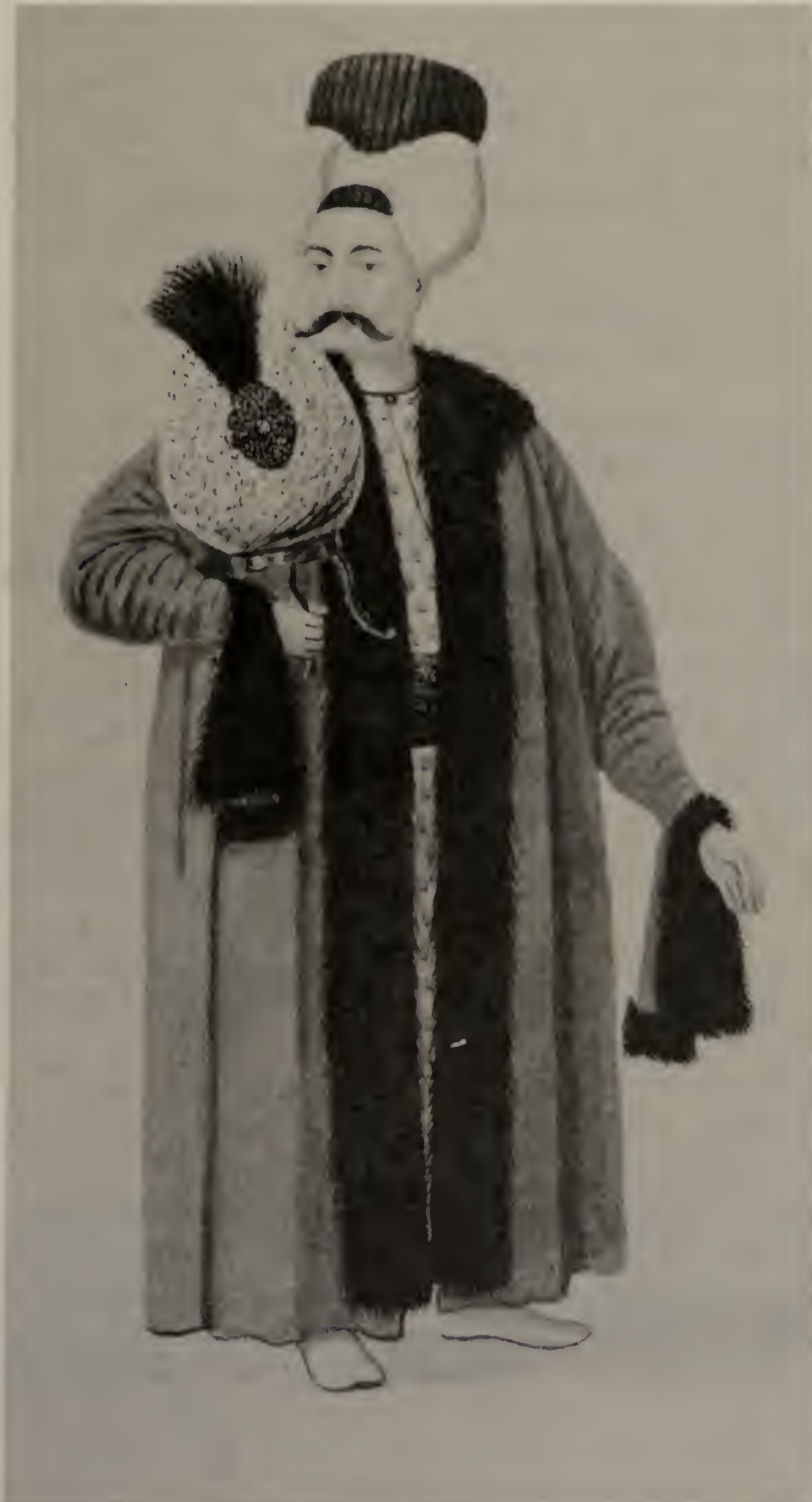
The Sultan's Master of the Turban

March 5 and 6, 1993 Herbst Theatre San Francisco