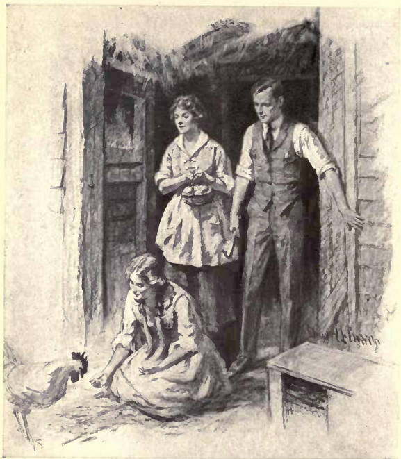
"Oh, how beautiful!" exclaimed Polly, all restraint leaving her young face and body as she fell on her knees before the sultan