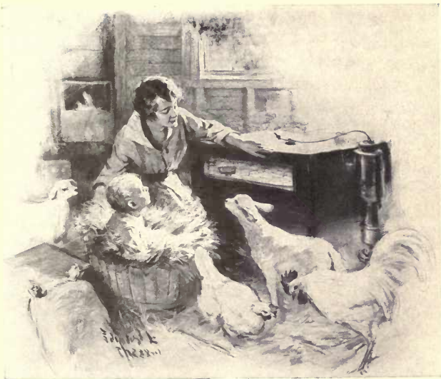
I put his babykins in a big feed-basket and the lamb twins came and welcomed him