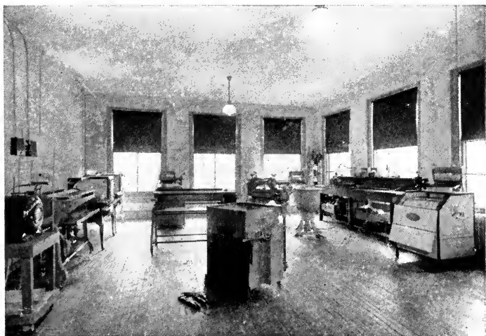
The light and spacious testing laboratory of the Department of Household Engineering, where all household devices must be tested and approved before they may be advertised in Good Housekeeping.