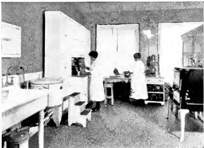
One of the three kitchen-laboratories of the Department of Cookery of Good Housekeeping Institute, where recipes are tested, tasted, and approved before they appear in the pages of Good Housekeeping.