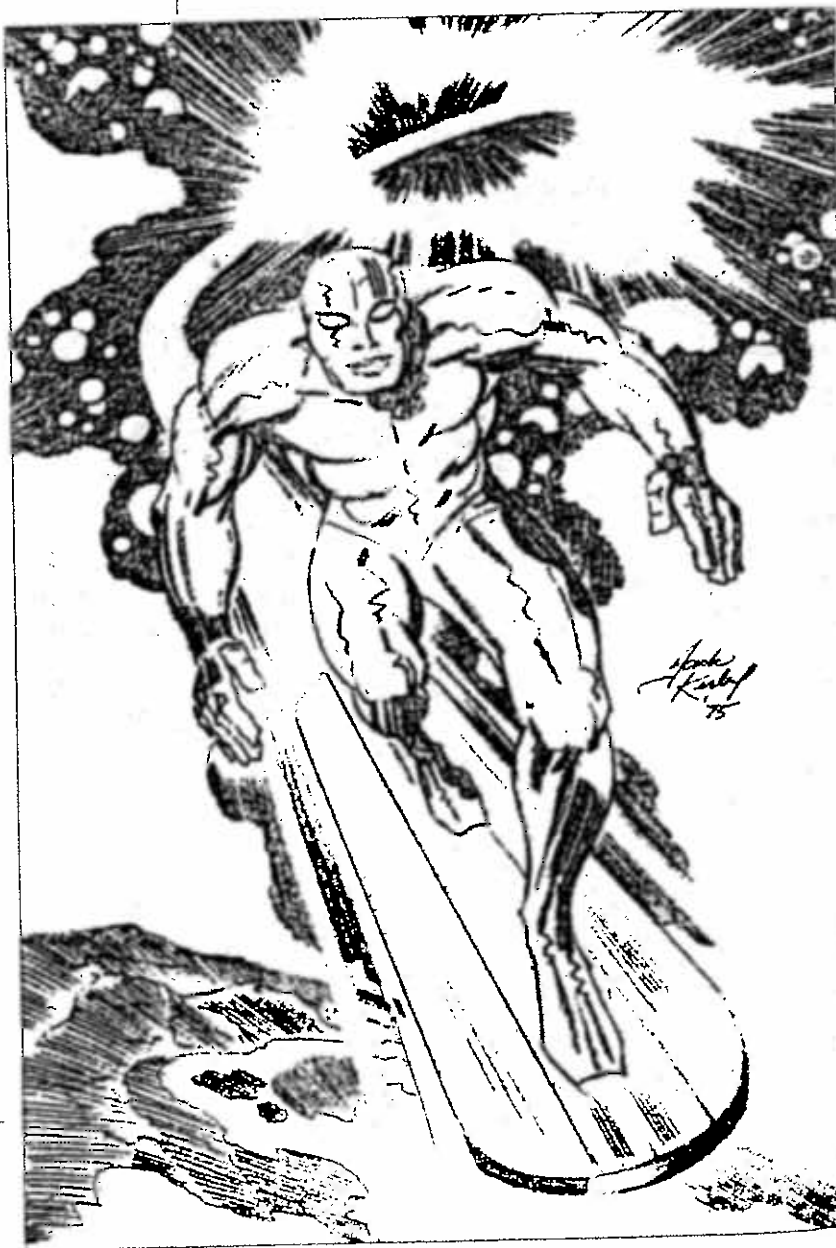
The drawing that became the cover for the 1975 Comic Art Convention program book.

Q: The material you did for Crestwood was, more or less, superior to what you were producing, just before and after your employment there. Was this due mainly to your having editorial control? KIRBY: Yes—in Crestwood, we had complete control of editorial policy, of writing, of artwork. We set our own standards and Joe and I just about had complete say over our material. We tried everything! We were getting into satirical strips for the first time. I tried to do a satirical super-hero with Jack Oleck's Fighting American in order to get something new and, hopefully, get some response from a declining readership. They did as well as any books of their time. It sounds like I might be finding excuses, but the field was in very bad straits at that time. Not only did publishers have internal pressures, but they also had external pressures. One day a guy might buy a new car, and the next day find the publisher cleaning out the offices. They were in a shaky frame of mind. Only the publishers with outside sources of revenue had any confidence at all.