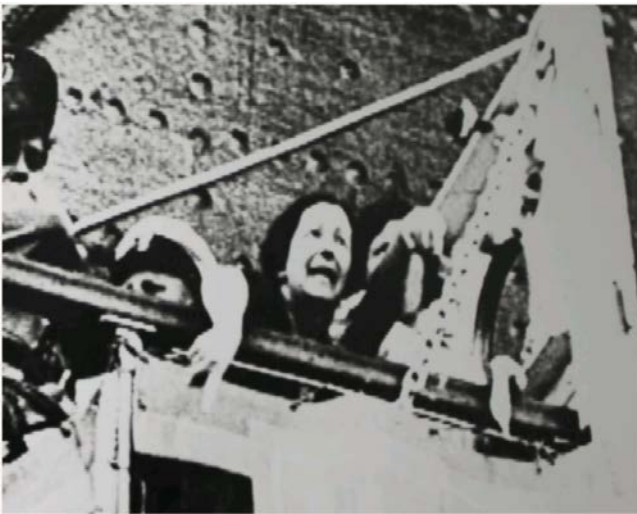
A woman cries as the St. Louis pulls away from Havana, 1939. | Keystone-France via Getty Images

Source: "Map Showing the Voyage of the St. Louis, May 13-June 17, 1939.", American Jewish Joint Distribution Committee Archives, "The Story of the S.S. St. Louis (1939)"; http://archives.jdc.org/educators/topic-guides/the-story-of-the-ss-st.html (Last visited February 5, 2017).