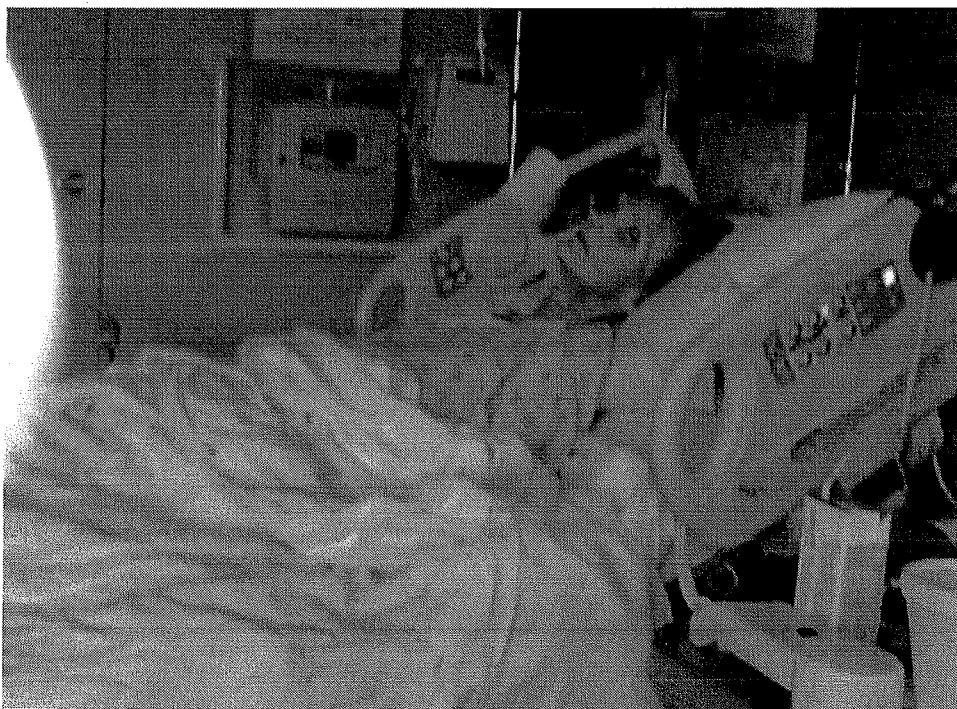
This was on June 2, 15 days before she died at home. Here's how she looked as a healthy woman.

I am sorry to be the bearer of such distressing news. But as your husband was one of the people suggesting my wife's death was a scam that I was trying to pull on people, I felt you deserved to see this picture.