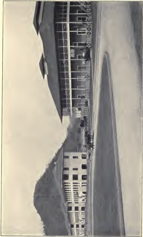
Police Station, Balboa