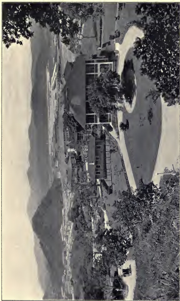
General View of Balboa Heights and Pacific terminals. Entirely new settlement built since 1913