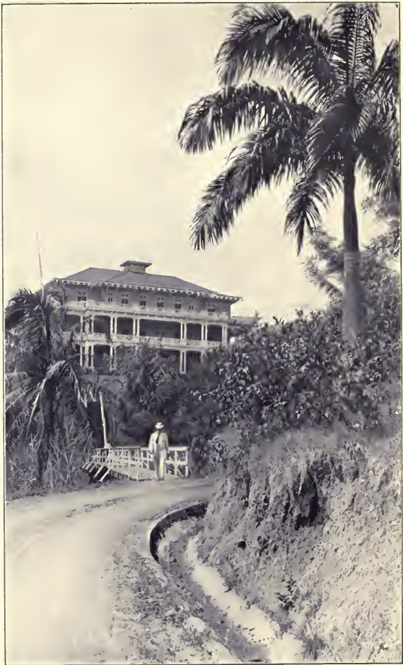
Former Administration Building, Ancon. Now Court Building and general office for Army