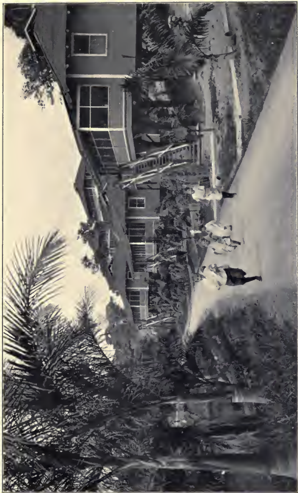
Street scene Balboa Heights