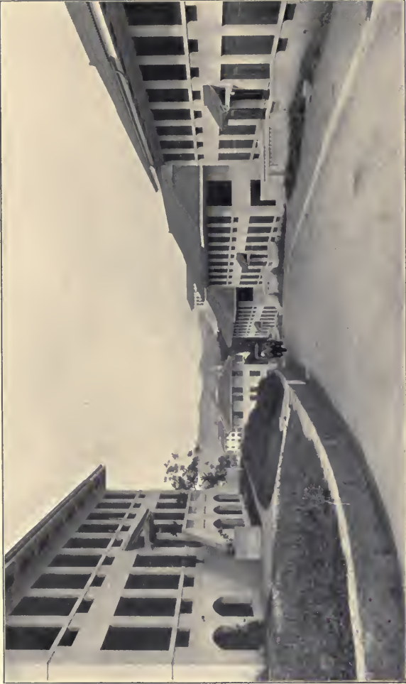
Street scene new town of Balboa