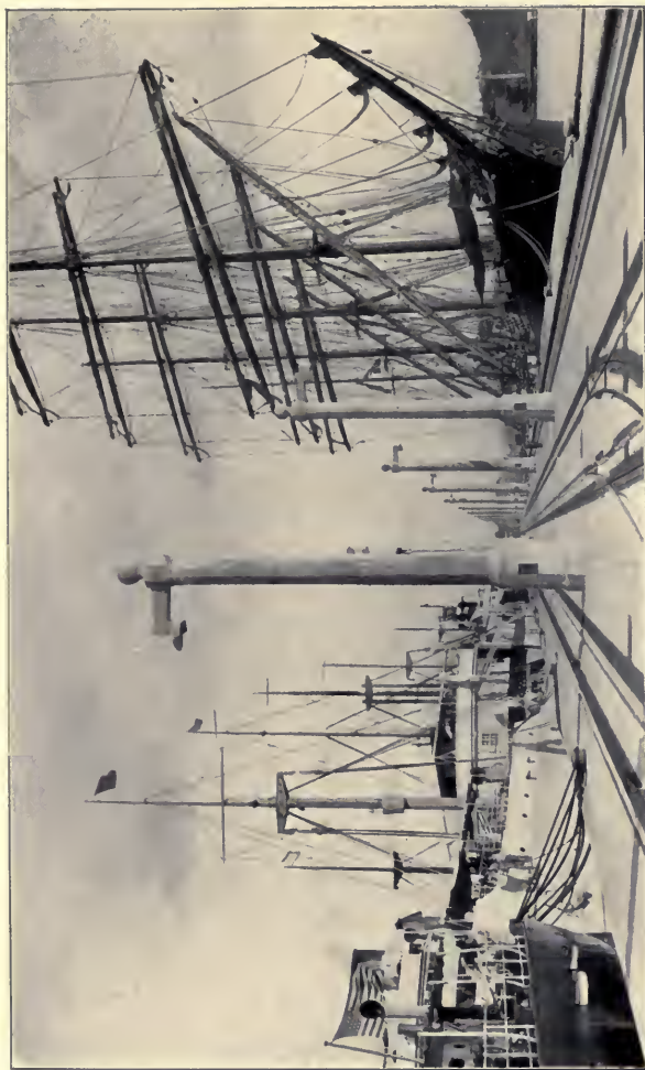
Shipping held at Pedro Miguel locks because of new movement of slide in Culebra Cut. March 10, 1915