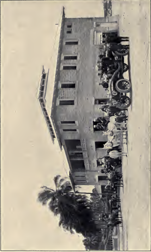
Fire Station and Apparatus, Cristobal