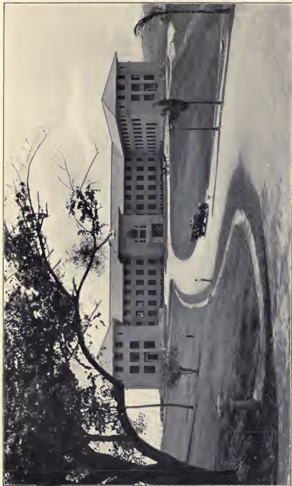
New Administration Building, Balboa Heights