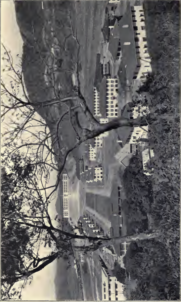
New Administration Building and new town of Balboa in foreground