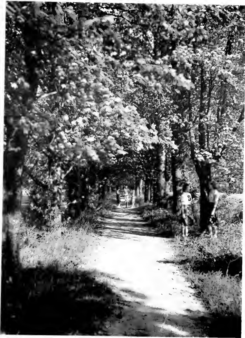
A Rustic Lane