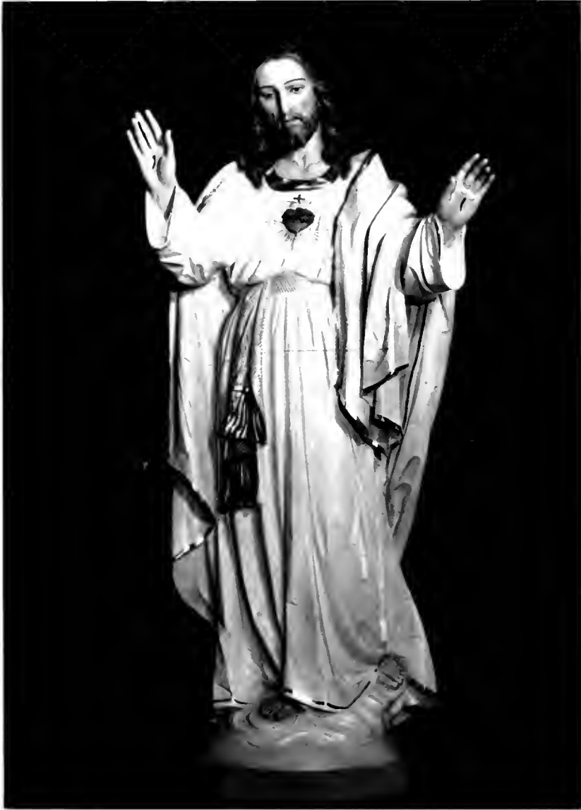
The Patron of Our School