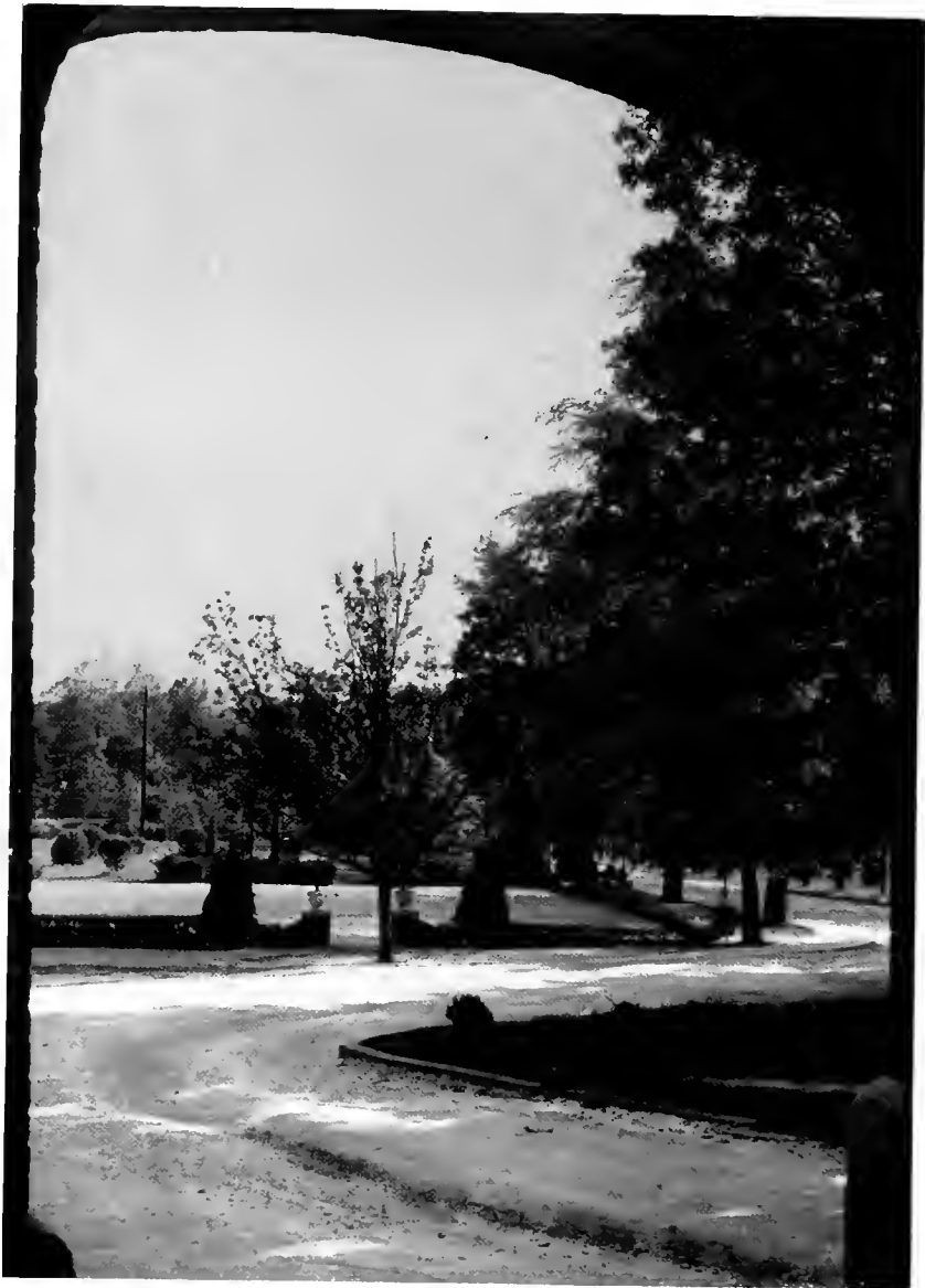
Campus Through The Arch