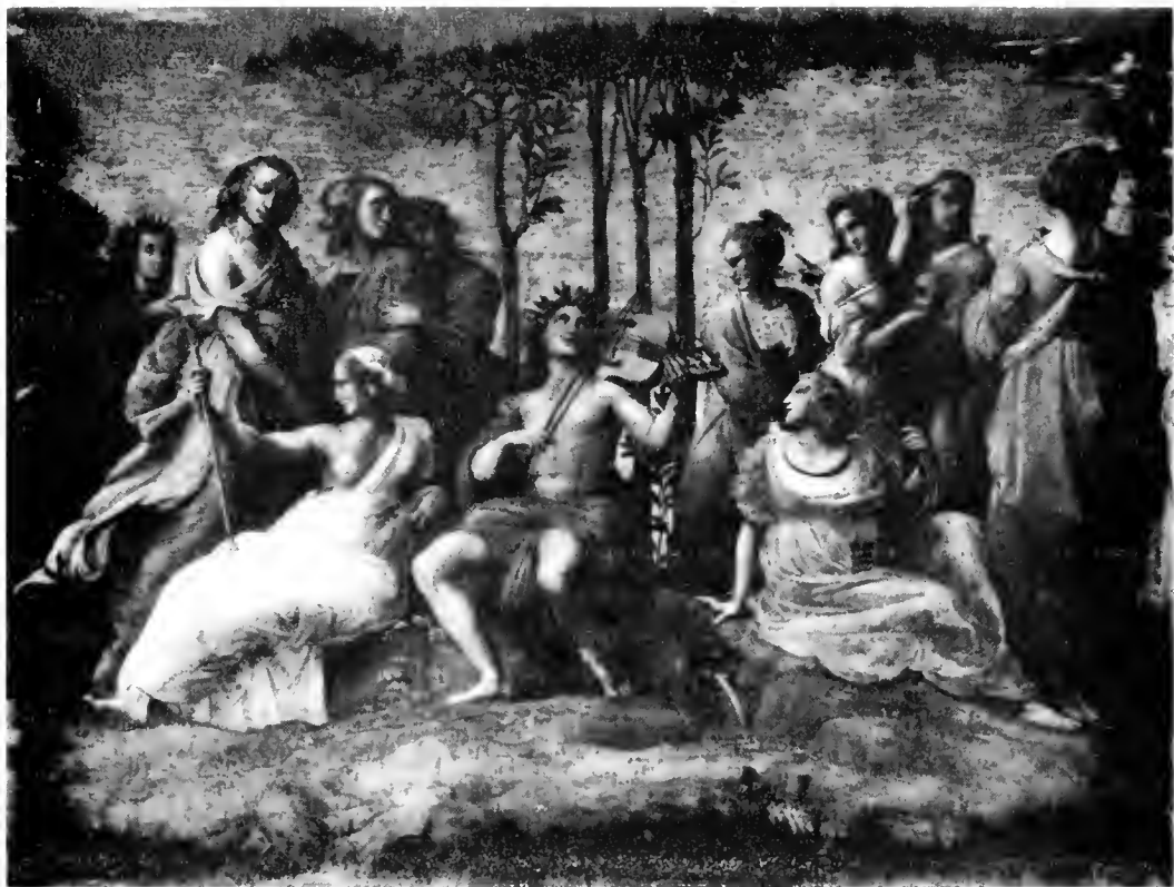
Raphael. Apollo and the Nine Muses, detail from Parnassus , Stanza della Segnatura, Vatican.